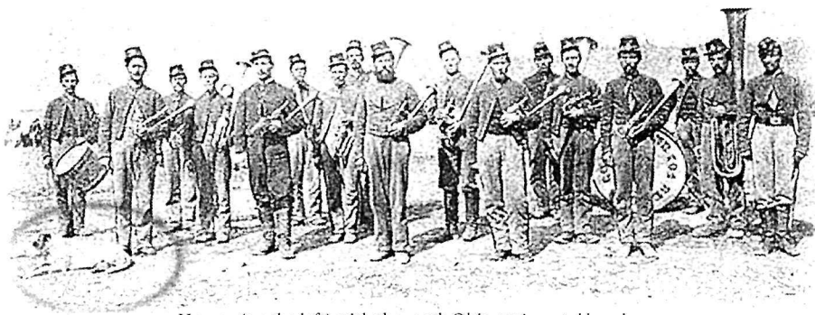
Harvey (on the left) with the 104th Ohio regimental band