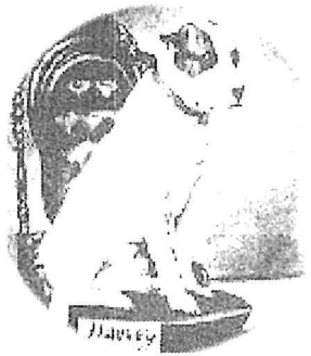
Harvey depicted on a 104th Ohio Infantry reunion keepsake button