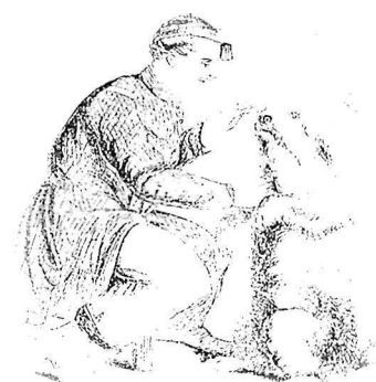
Peterson's Magazine, October 1863