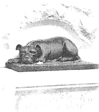
Statue of Sallie on the Eleventh Pennsylvania Infantry monument, Gettysburg National Military Park

Men died by the thousands during the American Civil War; many more mourned their losses and cried out for the erection of memorials, parks, and monuments so that no one would ever forget them. What few did at the time was cry for those who died beside brave soldiers, those who did not ask why America fought itself, but instead, eagerly stepped forward, tail wagging, to march beside their masters.