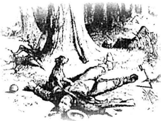
Dog staying with his fallen master, Frank Leslie's Illustrated

In 1861, men marched off to war carrying a menagerie of creatures: regiments and companies were represented by cats, bears, goats, pigs, and birds, including a patriotic bald eagle. However, the most popular mascots were dogs. Even though the Ninth Connecticut Infantry's pig, "Jeff Davis," could stand on its hind legs and fall into line during inspections, and the 43rd Mississippi's camel would watch over his men and never stray, dogs remained the most common and beloved mascots of the Civil War.