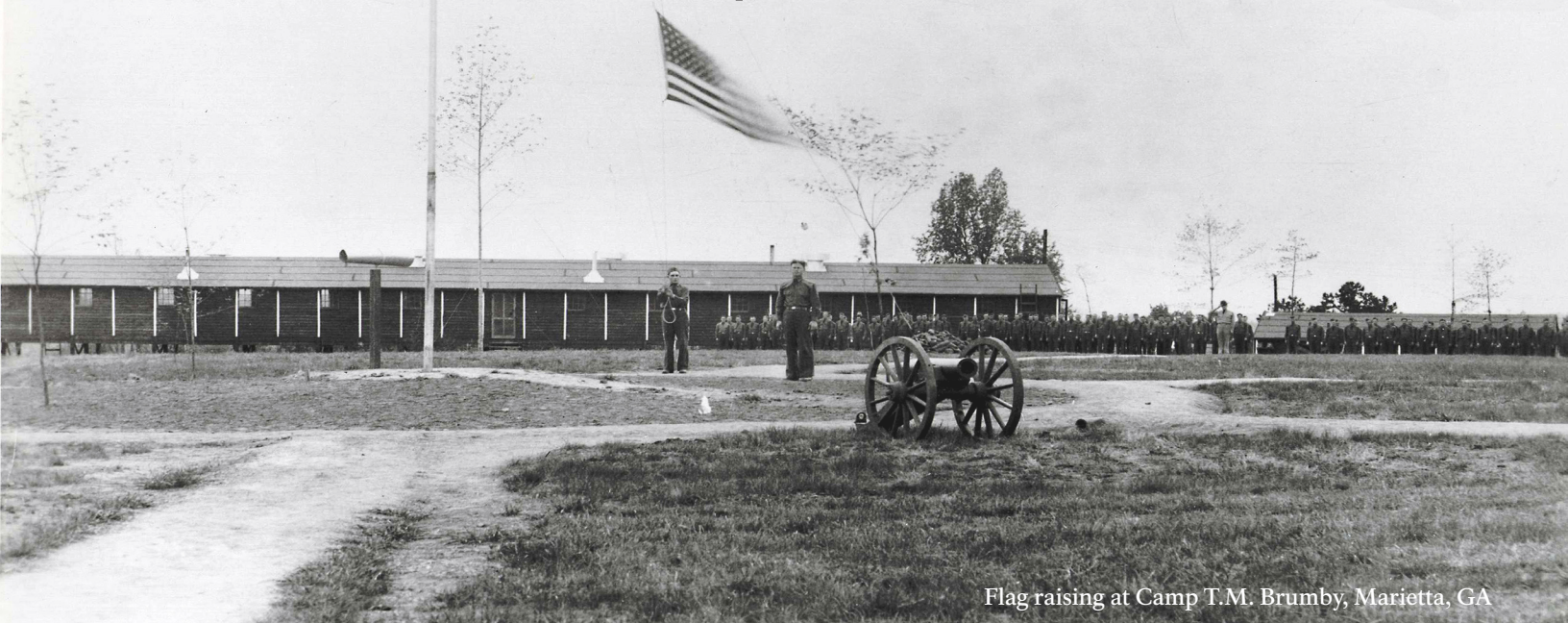
Flag raising at Camp T.M. Brumby, Marietta, GA