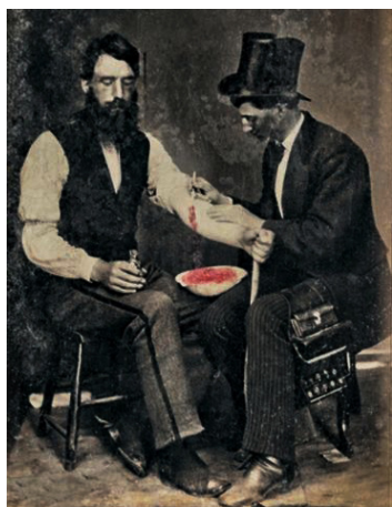
Doctor bleeding a patient, 1864

Despite unfortunate occurrences, most physicians in the nineteenth century cared for their patients as best as they could by applying the knowledge and technology available to them at that time. Medical science advanced rapidly after the Civil War, which provided scores of injured and ill patients on whom new procedures could be tested.