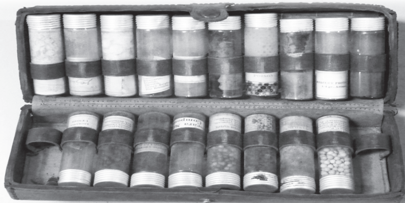
Physician's pocket case containing vials of handmade pills, 1860s