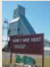
Quincy Mining Company No. 2 Shafthouse