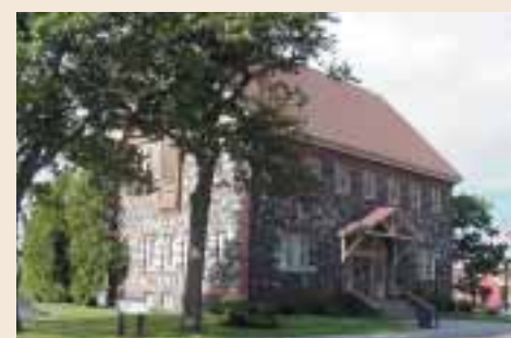
C & H Public Library

From 1888 to 1968 the top administrators of the powerful C&H Mining Company made decisions under this roof that influenced mining technology, engineering, and labor worldwide. Located in Calumet, the building was rededicated in 2002, and now serves as headquarters for Keweenaw National Historical Park.