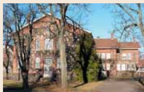
C&H Mining Company General Office Building

Originally a wooden structure built in 1894, the steel frame of the No. 2 Shafthouse was erected in 1908. It still stands tall on Quincy Hill, one of very few remaining examples of the engineering feats of copper mining. Tours offered by the Quincy Mine Hoist Association include a surface tour of the shafthouse and underground mine tours.