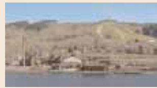
Quincy Smelting Works