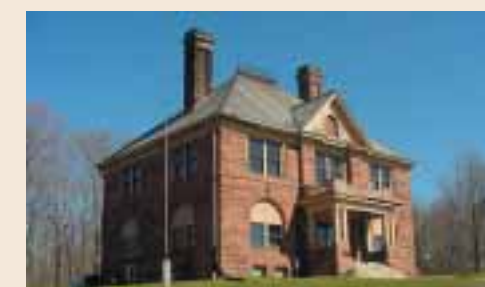
Quincy Pay Office

Congress established Keweenaw National Historical Park in 1992, directing it to be operated on a partnership premise. Thus, the park preserves and interprets the area's copper mining history in conjunction with seventeen Cooperating Sites located throughout the Copper Country. Through this unique collaboration, the industrial history of the Keweenaw will be preserved for the education and enjoyment of future generations.