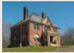
Quincy Pay Office