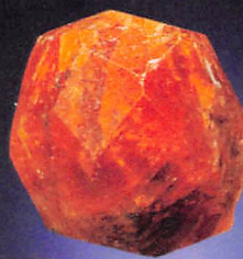
Spessartine Loliondo, Tanzania