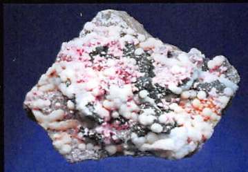
Rhodochrosite, Calcite Stambaugh, Michigan