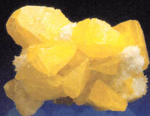
Sulfur Maybee, Michigan