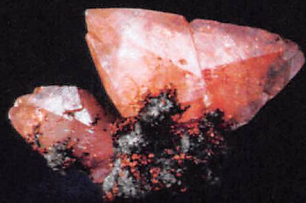
Calcite, Copper Hancock, Michigan

Our gift shop offers earth products from around the world.