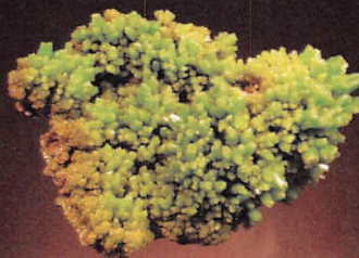
Pyromorphite Yangshuo, China