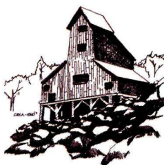
Delaware Mine Tours

Tours are offered daily from mid-May thru mid-October. Light jackets and comfortable walking shoes are recommended.