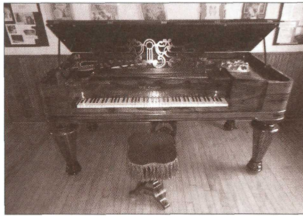
The restored 1852 Emerson piano was rescued from the 1912 fire that destroyed the Phoenix Hotel in Eagle River. It is now on display in the museum.

At Clifton, a one-room school served the miners' children, and three churches were established to meet the spiritual needs of the miners' families. A small village of Ojibwe (Anishinaabe) Indians also lived nearby on the west side of the Eagle River.