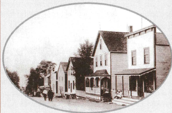
East Main Street, Eagle River

Houghton Township Community Building Eagle River, Michigan