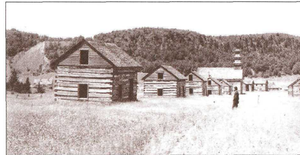
Clifton Ghost Town

However, between the 1870s and 1880s, the Cliff Mine and the towns of Clifton and Eagle River witnessed dramatic changes. As copper production declined, the Cliff Mine closed. Without jobs, the miners and their families moved away. The buildings in the town of Clifton were abandoned, and by 1900 it had become a ghost town.