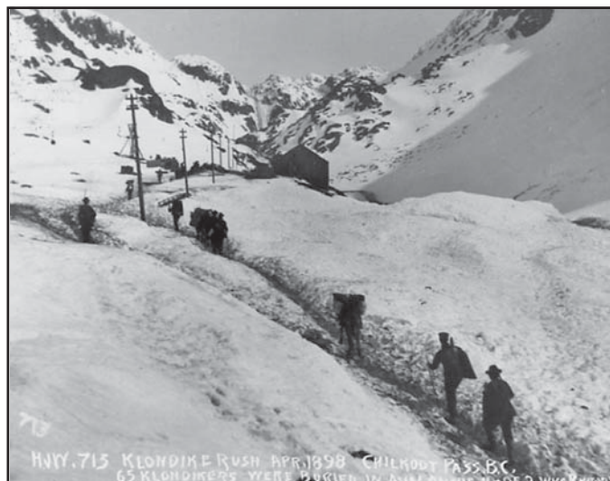
View of avalanche area two weeks after the event

At the height of the Klondike Gold Rush, the boom town of Dyea teemed with over 5,000 people. Merchants operated restaurants, trading posts, and hotels catering to stampeders bound for the Chilkoot Trail. Thousands of gold seekers transported their goods and equipment over the trail and the Chilkoot Pass during the winter of 1897-98, packing supplies on foot up the steepest sections. All had hopes of making it to the Klondike gold fields in the Yukon Territory of Canada, where they believed they would become rich beyond their wildest dreams.