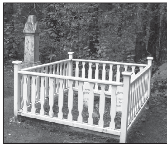
Klondike Gold Rush NHP

members of the Mathews family and other previous long-time residents of Dyea. Prior to 1979 these graves resided in the historic Town Cemetery in Dyea. During the 1970s, the Taiya River began washing the cemetery out as it is still doing today. To protect these graves, they were moved to this spot adjacent to the Slide Cemetery.