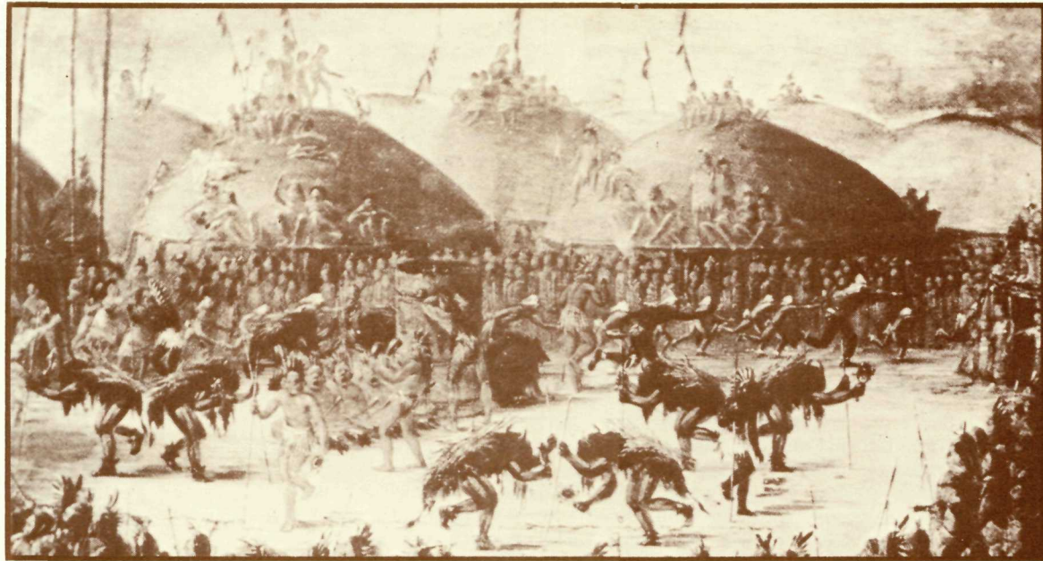
Knife River Indian Villages National Historic Site