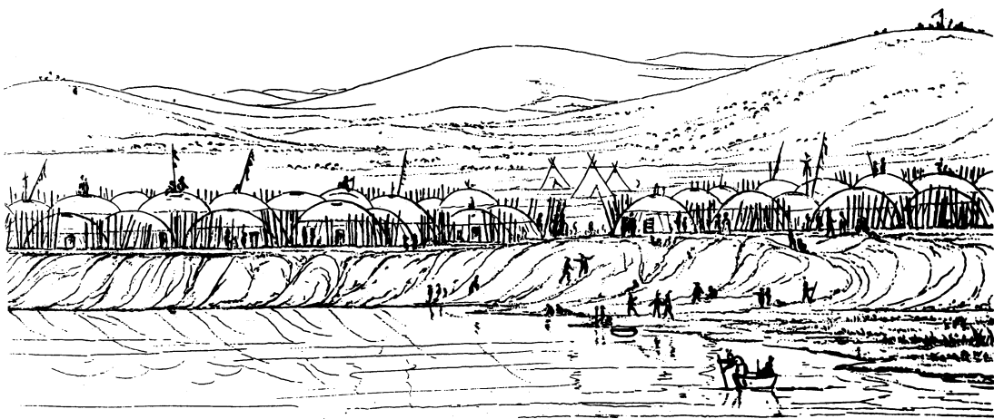
FIG. 2. The main Arikara village on the Missouri as it appeared to George Catlin in 1832.

men behind to conduct trade on a regular basis and then pushed on up the river to the Mandan villages. 22