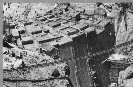
A giant rises in Black Canyon.

Hoover Dam is the key to all downstream control and regulation. The All-American Canal System takes water, controlled and regulated by Hoover Dam, from Imperial Dam westward to the Yuma, Imperial, and Coachella Valleys—southward and eastward to the valley and mesa lands of the Gila and Yuma Auxiliary Projects. There has never been a flood or drought on lands served by the lower Colorado River since Hoover Dam began storing water in 1935.