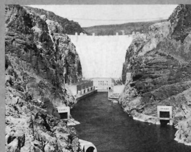
Hoover Dam as it looks today.