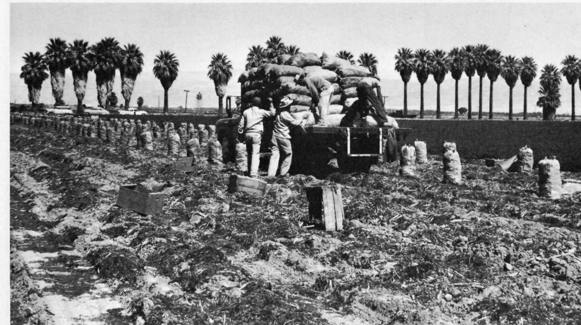
Harvesting a bumper carrot crop near Indio, California.

regulation of the Colorado River include the Palo Verde Valley, the Colorado River Indian Reservation, and the Yuma and Gila Projects in Arizona, and the Imperial and Coachella Valleys in California. When water reaches its farthest point on the All-American Canal System—which diverts from the Colorado River at Imperial Dam, 300 miles downstream from Hoover Dam—it has traveled some 500 miles since leaving Lake Mead and has required 10 days to make the trip.