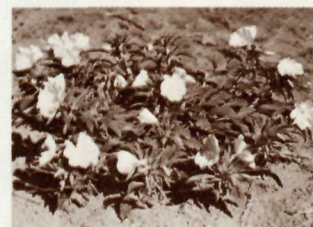
Two of the plants of the Desert Shrub Community are the Joshua-tree (left) and the desert primrose.

The Transzonal Community occupies the drainages and canyons which dissect the terrain at all elevations and thus occurs as a mosaic within and between the other communities. Honey mesquite, saltbush, and desertwillow thrive on the moisture