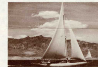
Many people are coming to appreciate the use of a natural force, the wind, instead of a gasoline engine when boating.

Motoring. Many miles of roads go through the bizarre desert scenery and fascinating communi-