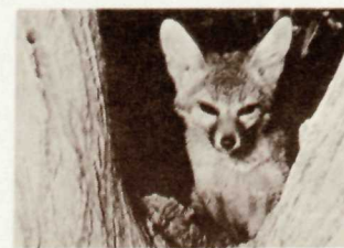
The kit fox makes its home on the desert where it preys upon rodents.

The rock formations exposed in the Lake Mead Country span nearly the full range of geologic history and are related to those exposed in Zion, Grand Canyon, and Petrified Forest National Parks. Marine and freshwater sediments as well as volcanic rocks are well represented. Faulting, folding, and erosion are beautifully displayed.