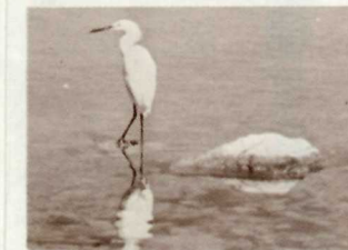
The egret feeds on small fish and frogs in the shallow waters at the lake edge.

Winter temperatures are sometimes rather low, particularly in the mornings and evenings, so be prepared with warm clothing.