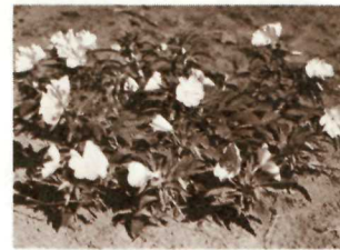
Two of the plants of the Desert Shrub Community are the Joshua-tree (left) and the desert primrose.

The Woodland Community lies generally above the 1,830-meter level and is limited in the recreation area to the Shivwits Plateau and the Newberry Mountains around Christmas Tree Pass. Utah juniper, Colorado pinyon pine, Gambel oak, and sagebrush characterize this community. Common animals include Utah rock squirrel, cliff chipmunk, and a variety of reptiles and birds. Mule deer are common on the Shivwits Plateau.