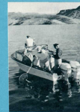
Fishing for bass, trout, and catfish is a year-round pastime on the lakes.

NATIONAL RECREATION AREA ARIZONA • NEVADA