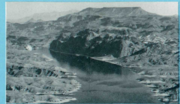
Shadows deepen on the upper reaches of Lake Mohave in the region known as the Black Canyon.

Fishing. If you fish from shore, you need a fishing license from Arizona or Nevada. Fishing from a boat requires a license from Arizona or Nevada along with special use stamp from the other state. Most marinas have fishing licenses.