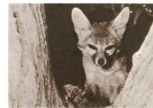
The kit fox makes its home on the desert where it preys upon rodents.

Four major communities of plants and animals occupy the recreation area, which lies within the northwest corner of the Mohave Desert.