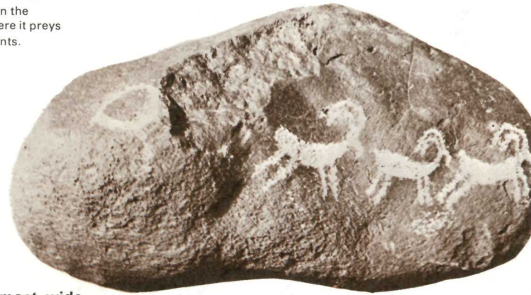
This etching of three bighorn was done long ago, probably by chipping the rock's weathered surface with a stone. In some places in the recreation area, the Indian petroglyphs show a variety of shapes. Whether they were done for pure artistic pleasure or with a message in mind is not known.

The Desert Shrub Community is the most widespread of these four living communities. It covers all valley floors and gravel slopes up to about 1,830 meters (6,000 feet) above sea level. Common plants include creosotebush, Mohave yucca, Joshua-tree, and a variety of cactuses. Animals of this arid community include kit fox, kangaroo rats, desert bighorn, and a variety of reptiles and birds.