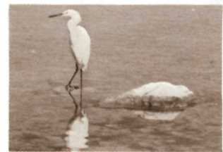
The egret feeds on small fish and frogs in the shallow waters at the lake edge.

Dissecting the terrain at all elevations are the drainages and canyons of the Transzonal Community , where a mosaic of species reside within and between the other communities. Honey mesquite, saltbush, and desertwillow thrive on moisture beneath gravelly wash bottoms. Animals of this community also belong to the surrounding communities.