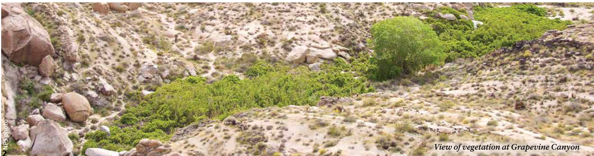
View of vegetation at Grapevine Canyon

Alert rangers immediately at 702-293-8998 if you see anyone vandalizing sacred petroglyphs or anything else at the park. For visitor information, please call 702-293-8990.