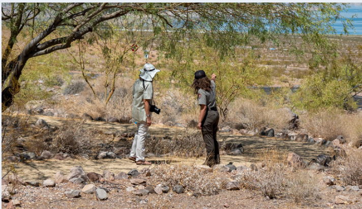
Lake Mead National Recreation Area visitor and staff member look into the horizon

The purpose of Lake Mead National Recreation Area is to provide diverse public recreation, benefit, and use on Lakes Mead and Mohave and surrounding lands in a manner that preserves the ecological, geological, cultural, historical, scenic, scientific, and wilderness resources of the park.