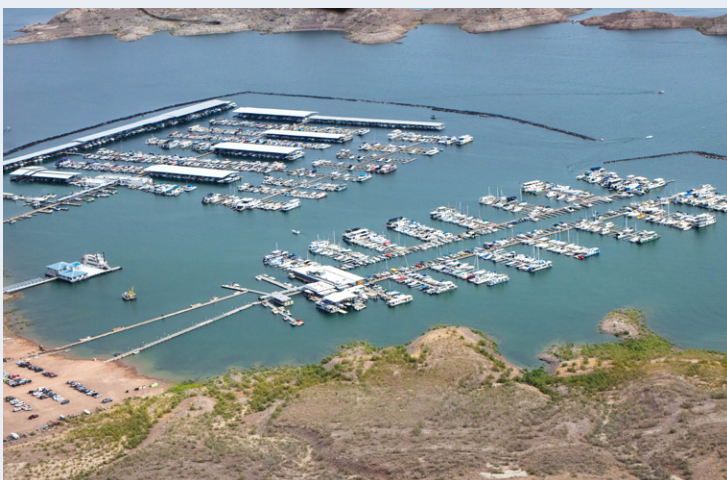
Aerial view of Hemenway Harbor, Las Vegas Boat Harbor, and Lake Mead Marina

Lands that were previously under water are increasingly traversed by visitors seeking land-based recreation or attempting to launch watercraft in unauthorized areas along the shoreline. The park is under increased pressure to protect and preserve archeological resources (submerged and terrestrial), historic structures, and cultural landscapes from impacts associated with marina relocations.