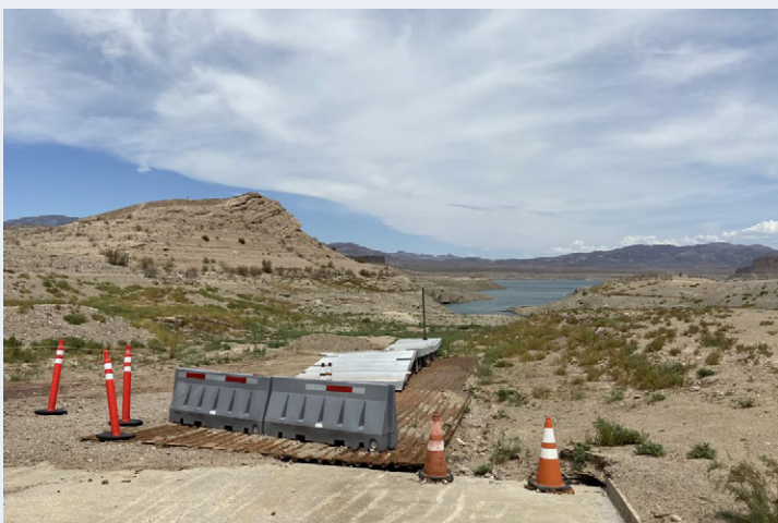
Temple Bar, July 2022