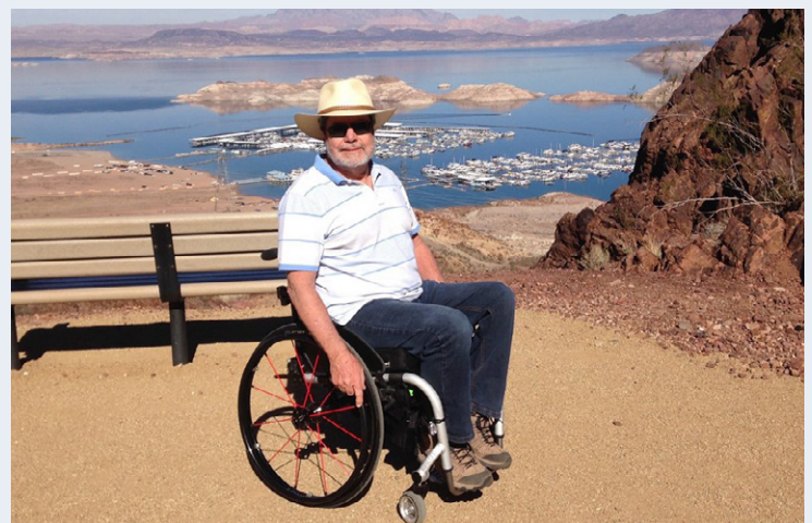
A recreational visitor on the historic Railroad Trail