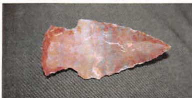
Arrowhead knapped from Alibates Flint.

Start your visit with a morning walk to the Alibates Quarries. Hear the tale of a stone that was so useful and valuable that it was used by tribes for thousands of years.