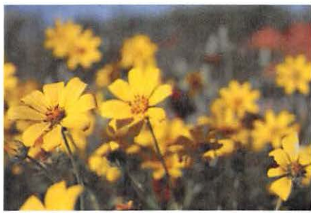
Wildflowers are abundant throughout the spring and summer.