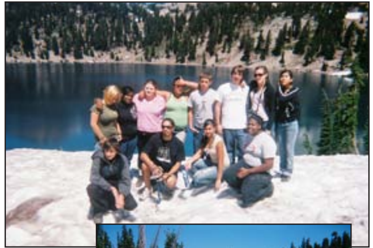
Above and right, Anderson Teen Center