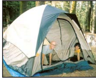
Youth Outreach Program in Redding

It was another wonderful year of camping for our kids: Five youth groups that totaled seventy-five youth and twenty-eight adults had successful trips to LVNP all because of the Lassen Park Foundation's Youth Camping Program which makes small grants to youth groups to organize camping trips. This year the groups who benefited were: Whitmore Elementary School, in Shasta County, Americorps Foster Youth Mentoring Program from Susanville, the Youth Outreach Program, Redding, Teens at Heart, Anderson, Youth for Change, Paradise. The Foundation also made a contribution of $500 to the Junior Scientist Program at Lassen Volcanic National Park and invested in the Interpretative Intern Program at the Park. The Interpretive Intern Program's eight interns logged 913 volunteer hours of their work in interpretation of the natural and cultural resources as well as visitor protection and maintenance.