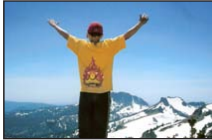
"Victorious on Lassen Peak- Youth for Change kids make it to the top!"

Is a camping trip just for fun, or are there valuable life lessons to learn? If we have no one to take us camping when we are young, how will we go? If we have a chance to go, will we get along with the other kids, or know how to put up our tent, or be afraid of bears? How will we cook our food or take a shower? Will we be able to keep up on a hike or lend a hand to someone who is slower? These are the elements of a camping trip that nurture growth of character in youth. A life-changing summer experience can render significant change in young people, but especially those from backgrounds of financial limitation, emotional stress, or behavior challenges. A coordinator of one of our Summer 2006 camping groups wrote, "I believe that the biggest change that occurred for the kids was that they gained a lot of confidence, strength and perseverance throughout the week. They have all been survivors their whole lives but the difference was that now they began to take care of each other."