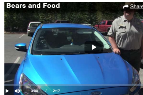
Click the image above and scroll to the bottom of the page to view the "Bears and Food" video.

Please help us keep Lassen open to visitors and its bears wild in nature! Recreate responsibly and use a bear-proof canister when traversing Lassen's backcountry.