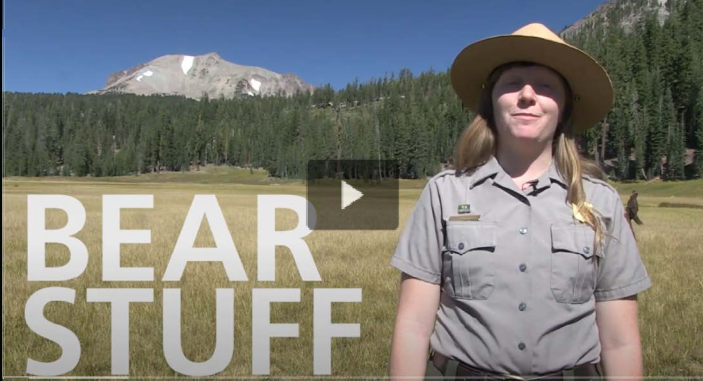
Click the image above for a fun "Bear Stuff" video. What is Bear Stuff?...