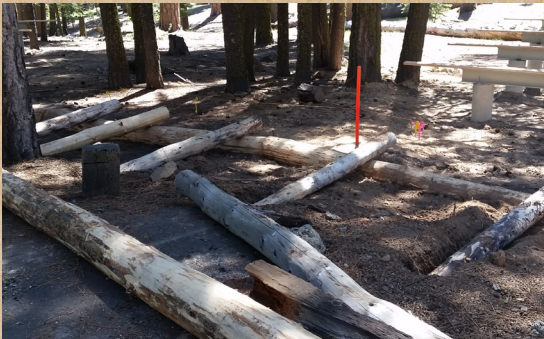
installation of the tent canvas.

NPS has completed the foundation work for the ten tents. Don Ajamian Construction expects to start work on the tent platforms next week with lumber donated by Sierra Pacific Foundation. Once the platforms are completed, the tent frames will be constructed and finished with