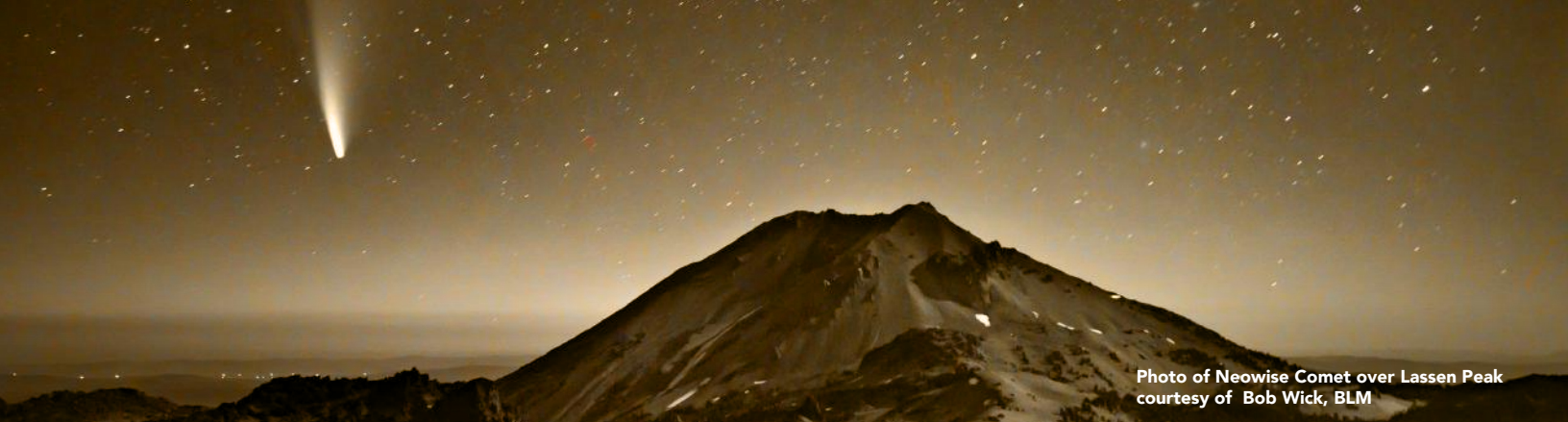
Photo of Neowise Comet over Lassen Peak