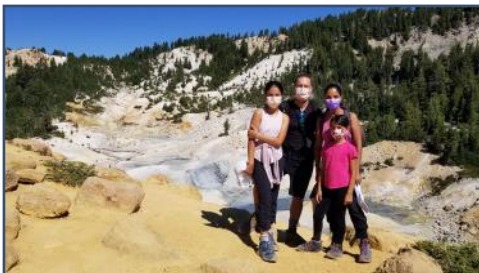
Park guests enjoying the newly redesigned Bumpass Hell Trail with face masks (2020).

During this public health crisis, spending time in outdoor spaces has become even more important for many Americans. Yet these unusual circumstances mean that all of us, from seasoned outdoor enthusiasts to families heading out to their local park for the first time, could use a little guidance about how to stay safe. Lassen Park Foundation has joined the Recreate Responsibly movement and proudly shares these guidelines for getting outside to keep yourself healthy and to maintain access to our parks, trails, and beaches.