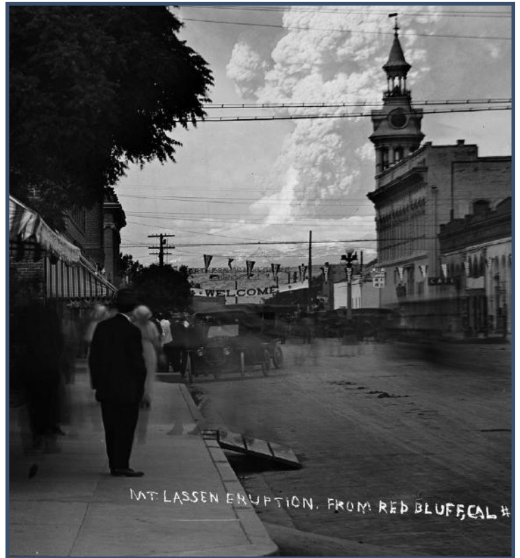
Eruption from Downtown Red Bluff

Amblur Kai was not finished. On May 22 an eruption blew open a new crater near the summit. Ash formed a mushroom cloud that could