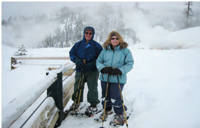
Snowshoers discover the billowing steam of Sulphur Works

Winter at Lassen offers the opportunity to step outside of the boundaries by trying something new or exploring new terrain. Once the roads disappear and the trails are hidden under snow, the entire park is free to explore! Keep in mind that winter at Lassen poses many dangers. The best way to ensure your safety is to be prepared. Read more about winter safety on pages 8-9.