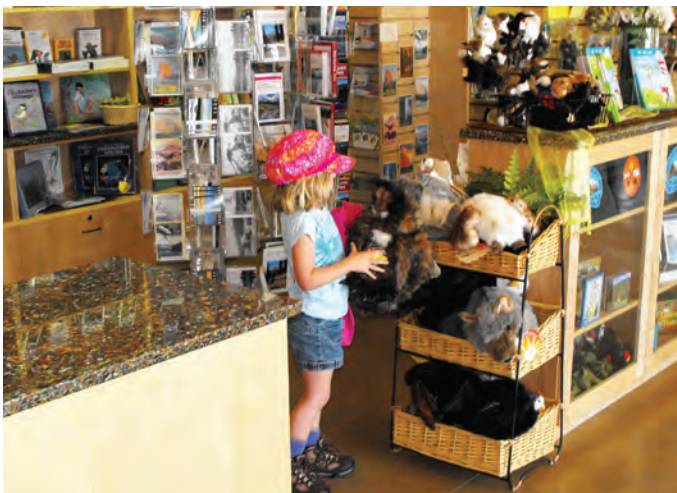
A young visitor brings a Great Horned Owl puppet to life

For information on how to join our association, visit us online www.lassenassociation.org , or contact us at (530)529-3450, or by e-mail at lassenassociation@yahoo.com .