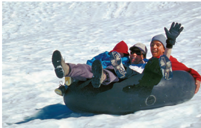
Families delight in sledding outside of the visitor center

If you are new to snowshoeing, consider joining a ranger-led snowshoe walk. Snowshoes are available for participants with a suggested $1 donation. For those more familiar with walking on snow, opportunities abound at both the north and south entrances. Be sure to bring your own snowshoes if you'd like to explore on your own! Read about suggested ski and snowshoe routes on pages 6-7.