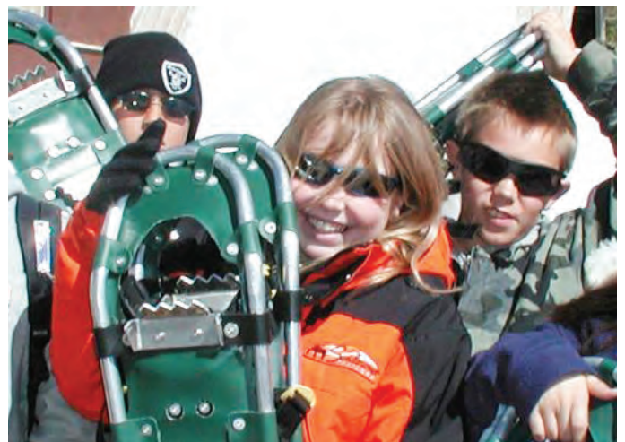
Students explore winter at Lassen in the park's snowshoe education program

Please become a Friend of Lassen by contributing to the Lassen Park Foundation! Your donation is tax-deductible. To learn more visit www.lassenparkfoundation.org , call (530) 898-9309, or email info@lassenparkfoundation.org .