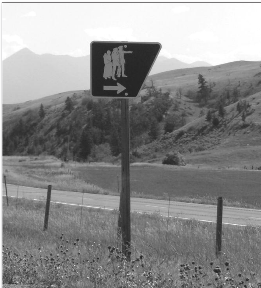
Figure 1. Lewis and Clark National Historic Trail sign along highway 91 between Livingston and Bozeman, Montana puts the imprint of history on the landscape, 2004.

Conversely, I look at how government agencies and environmental nonprofit organizations help to frame present-day nature conservation in terms of a site's historic and cultural significance rather than simply championing its intrinsic biological or natural worth. The article also addresses how current commemorations reveal competing perceptions of place and history,