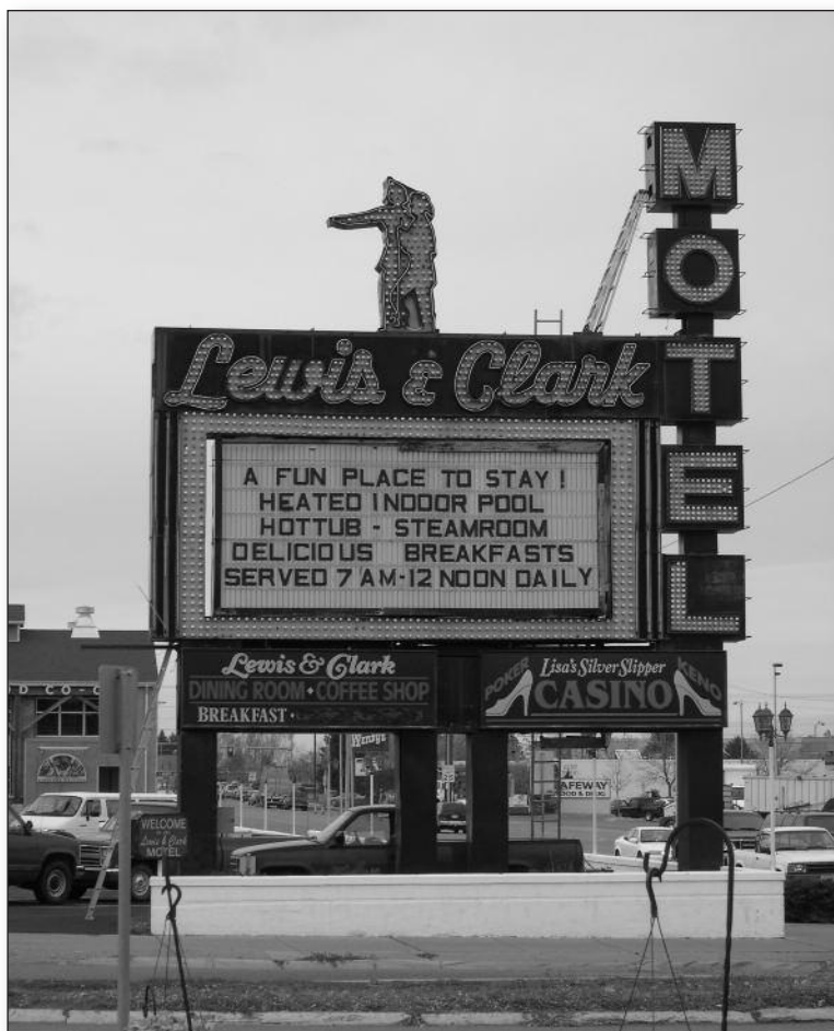
Figure 2. Lewis and Clark Motel sign illustrates the popular use of history to help create a sense of place in the northern Plains.

to St. Louis in 1806 soon faded from popular memory in the United States. 6 When I turned to the first edition of the Contributions of the Historical Society of Montana from 1876, I found practically nothing on the now-famous expedition. The author mentioned it mostly as a way to dramatically describe how an expedition member, John Colter, was nearly killed by Blackfoot Indians. 7