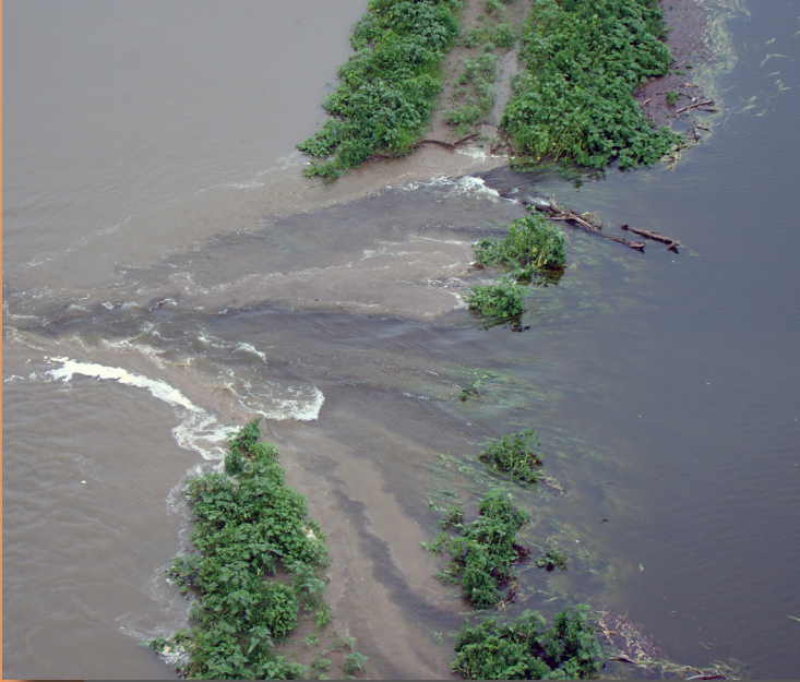
Aerial views of Missouri River flooding between Kansas City, Mo., and Rulo, Neb., June 20, 2011.