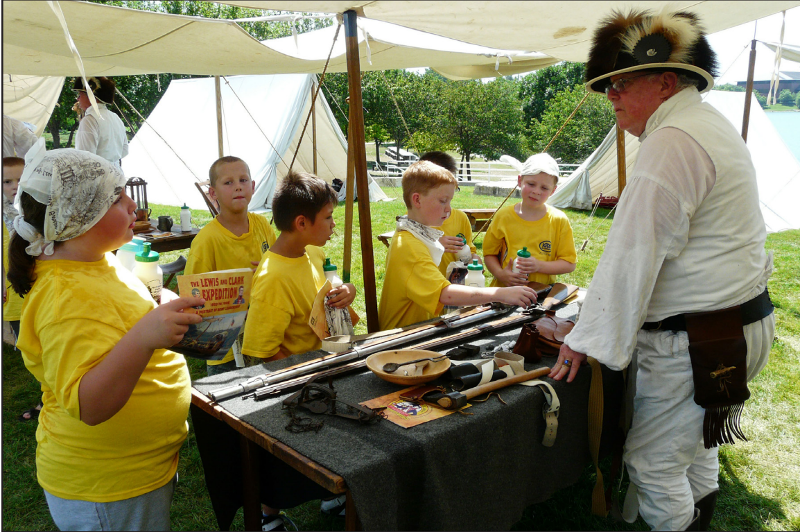
Above and Cover Photo: Members of the Discovery Expedition of St. Charles interact with Omaha area youth during the 2011 Lewis and Clark Trail Heritage Foundation Annual Meeting.

The encampment was open to the public and was also enjoyed by members of the Lewis and Clark Trail Heritage Foundation who were gathered in Omaha for their annual meeting.