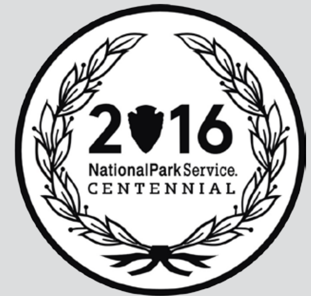
Conceptual mock-up of the Centennial Challenge Volunteer Coin.