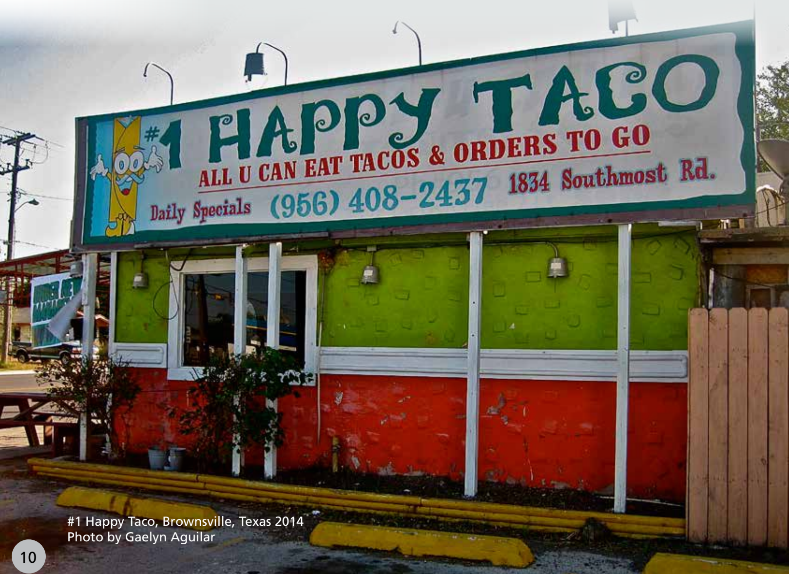
#1 Happy Taco, Brownsville, Texas 2014