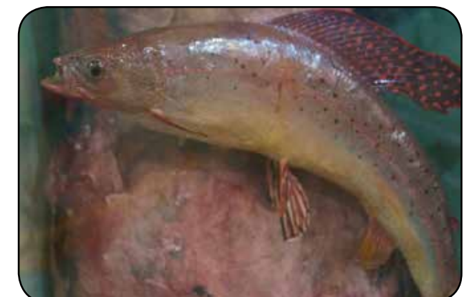
Undaunted Anglers exhibit.