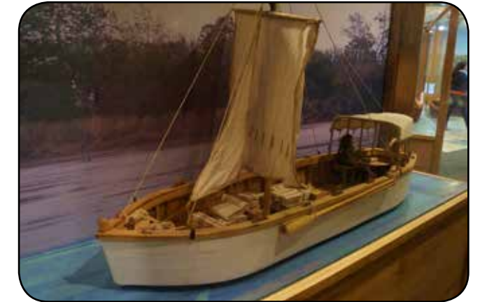
Scale model of white pirogue