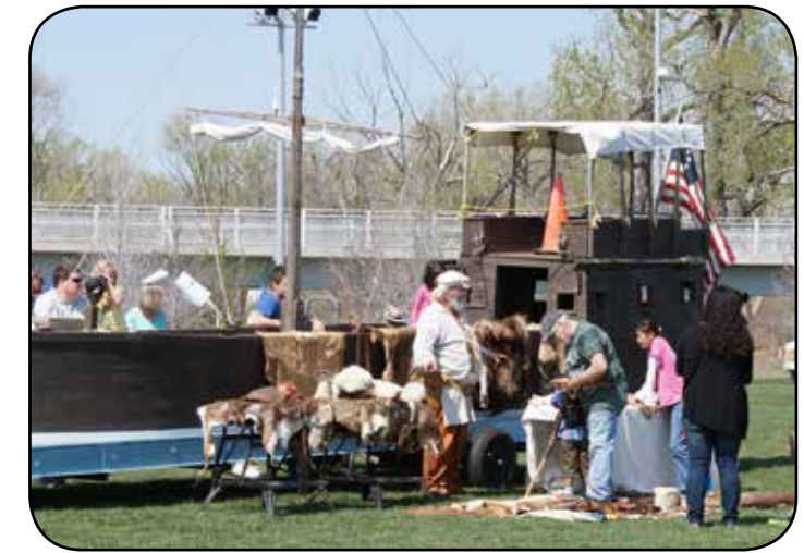
Small-scale replica keelboat was a hit!

The festival was hosted and organized by the Lewis and Clark National Historic Trail but its success was due to the many partners who participated. Thank you to all involved: City of Council Bluffs Park and Recreation, Omaha