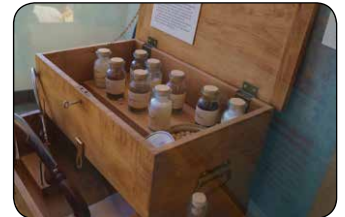
Replica medicine chest