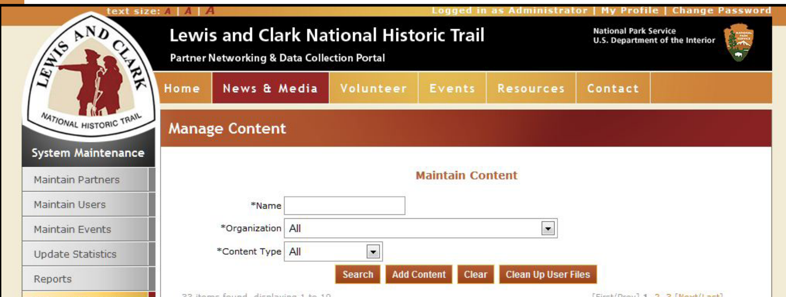
Partner Networking & Data Collection Portal for Lewis and Clark National Historic Trail.

Give it a try! The Portal has been designed so that you can customize the program to fit your needs. Don't delay, get started recording your statistics today! ■