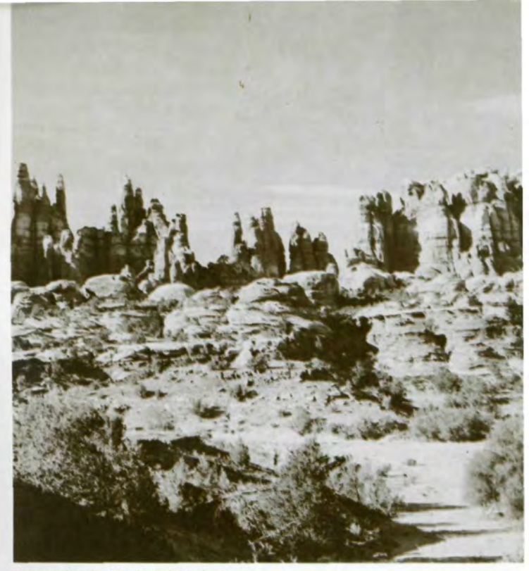
Canyonlands National Park. Utah

There is a minimum charge of $1.00 for each mail order