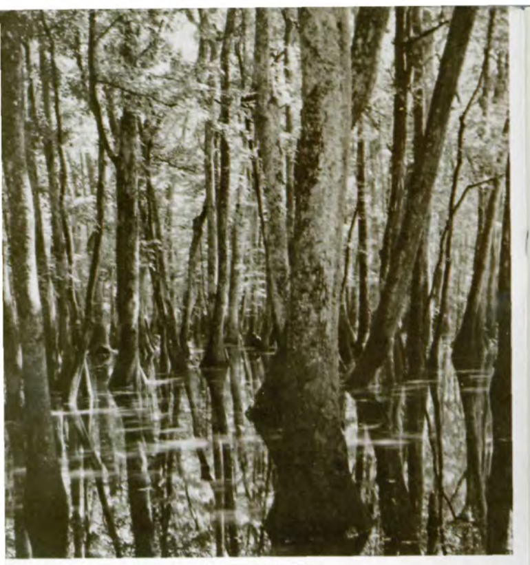
Natchez Trace Parkway, Miss -Tenn -Ala