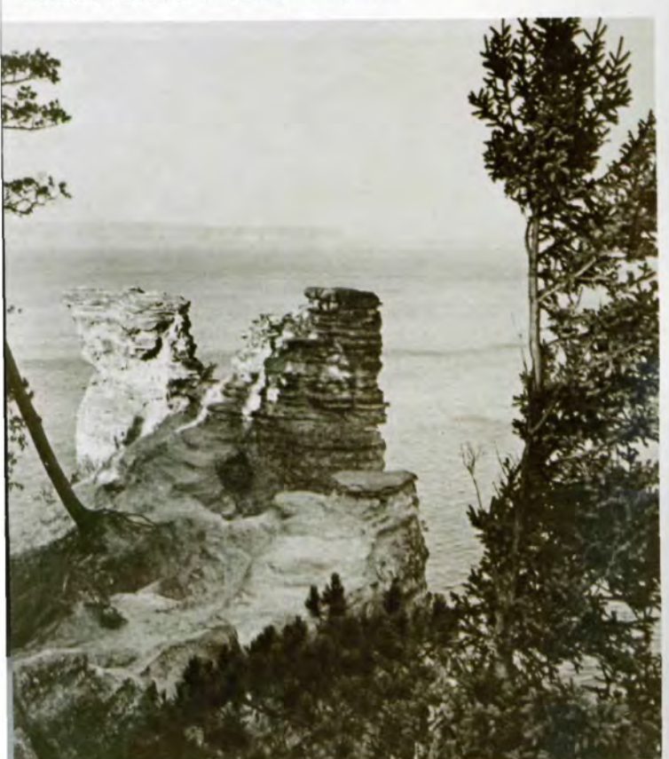
Pictured Rocks National Lakeshore, Michigan

These are little known places in America's National Park System. These are places that may be new or off the beaten track. Yet they—and many more like them—contain as much of the nation's beauty and portray as vividly the heritage of this great land as do the better known parks visited by so many millions of people every year. This booklet lists those places where you will find almost everything you might see in more popular parks—except crowds. I hope that many Americans will visit these lesser used areas of their National Park System. You should have many new and wonderful experiences. And, by avoiding crowds in busier parks, you'll be helping us protect the irreplaceable wonders which are America's National Parks.