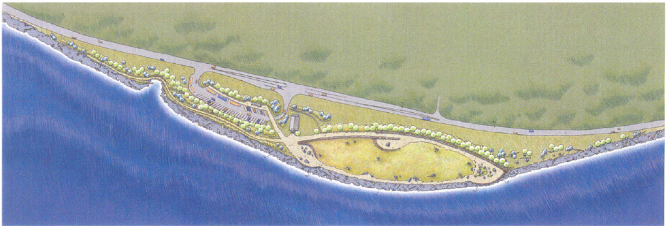
Conceptual Site Plan: Station Camp unit.