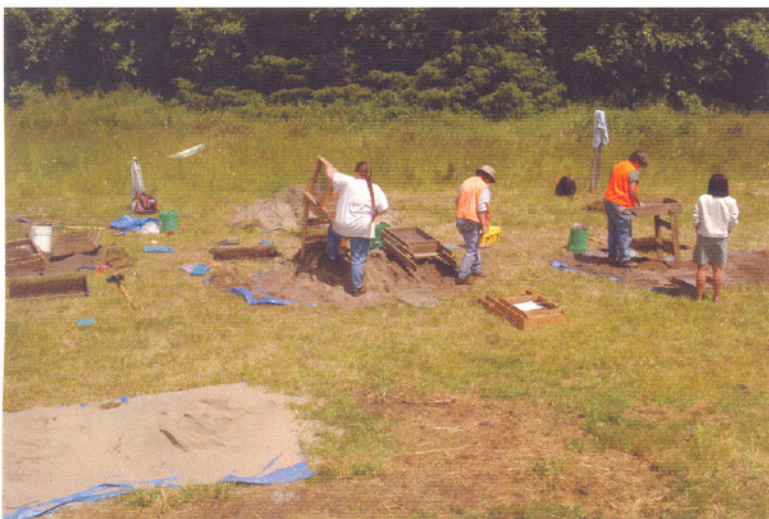
Archaeologists test SR 101 proposed right of way