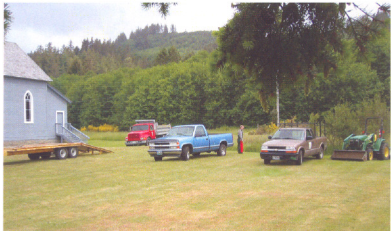
Fort Columbia State Park & Lewis and Clark NHP employees brush and clear site for archaeological excavations