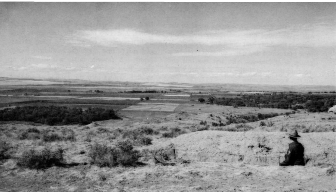
Looking across the Little Bighorn to the scene of Reno's action in the valley from a restored trench at the Reno-Benteen defense site on the bluff.

mount was given and a line of battle was quickly formed while the horses were led to the timber near the river. Outflanked by warriors, the troopers themselves soon withdrew into the timber.