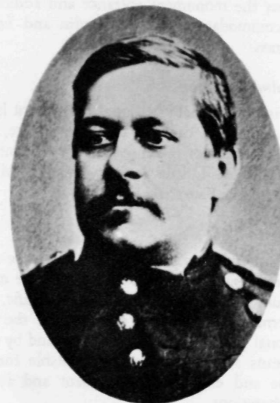
Maj. Marcus A. Reno, Seventh United States Cavalry.

Immediately, Benteen was ordered to scout the bluffs to the left of the main force. As soon as Benteen had left, the Custer and Reno battalions took leave of the pack train and headed down what is now Reno Creek toward the Little Bighorn River and the supposed