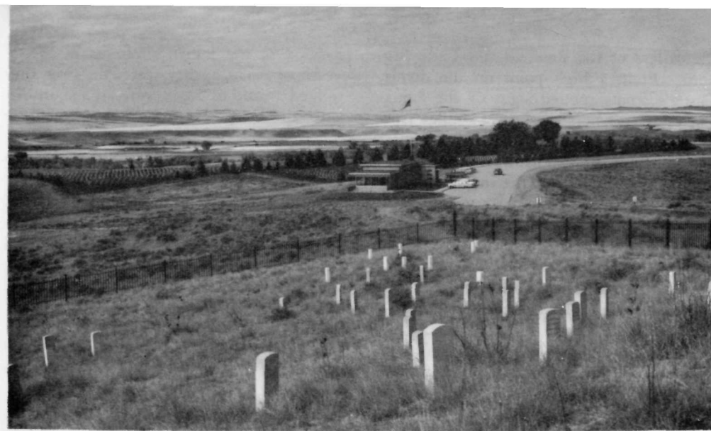
View from Custer Hill: Markers in foreground show where Custer's men fell; visitor center and National Cemetery appear in distance.

Custer Battlefield was made a National Cemetery by order of the Secretary of War in 1879. It was transferred from the War Department to the National Park Service, U.S. Department of the Interior, in 1940. The name was changed to Custer Battlefield National Monument in 1946. The 1.2 square miles of the monument contain the National Cemetery, the ridge where Custer and his men made their stand against the Indians, and, in a separate section upstream, the site of the Reno-Benteen defense perimeter.