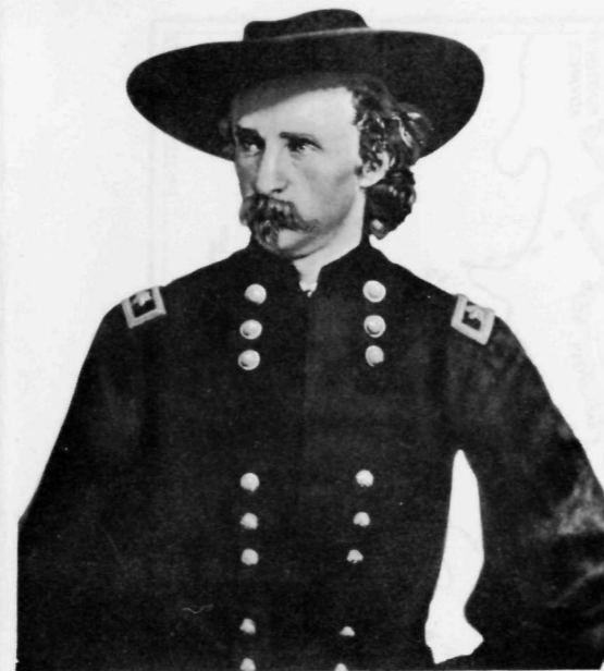
Maj. Gen. George A. Custer in 1865.

Less than 6 years later, in 1874, Colonel Custer led the 7th U.S. Cavalry Regiment on an official reconnaissance into the Black Hills, heart of the Indian reservation. Prospectors who accompanied the expedition discovered gold. When the news spread, hordes of gold seekers invaded the region.