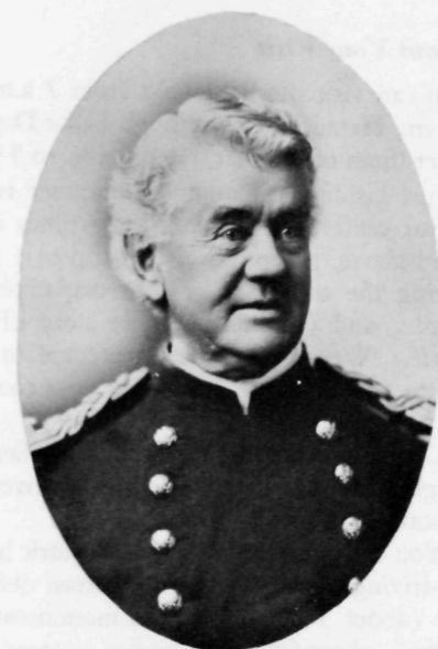
Capt. Frederick W. Benteen, Seventh United States Cavalry.

When the Indians rushed out to fight him, Reno formed his men into line. Forward they rode, appalled by the numbers of Sioux ahead. Reno believed that his force could not charge through the horde in front of him and that his best chance was to dismount his men and fight on foot. The order to dis-