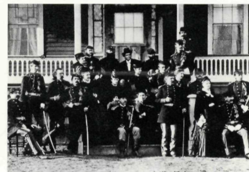
Custer, hatless and standing casually third from the left, poses with other officers and ladies of the 7th Cavalry at Fort Lincoln shortly before the expedition moved out against the Indians. The woman nearest Custer on the first step is Mrs. Custer.

"On the morning of June 17, General Crook collided with this array, and after a severe action lasting most of the day he turned about and marched back to Goose Creek (near present Sheridan, Wyo.) to call for reinforcements. The Indians returned to their tepees in triumph and at once moved down to Reno Creek, crossed the Little Bighorn, and laid out a new camp. It lined the west bank of the river for 3 miles and sprawled in places all the way across the mile-wide valley."