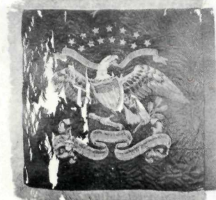
The blue and gold regimental flag which Custer's men carried on the campaign of 1876 is now displayed in the park museum.

"As a matter of fact, a great many more Indians were absent from their agencies than the Bureau had reported, and they continued to flock to Sitting Bull's standard throughout the spring. By June the scattered bands had begun to come together in a single village that formed one of the largest in the history of the Great Plains.