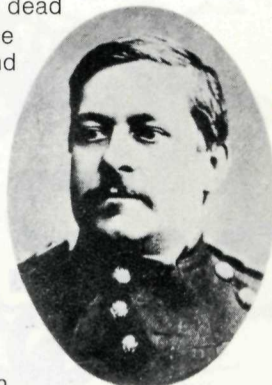
Maj. Marcus A. Reno