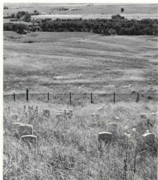
In waves of tall prairie grass, white marble tablets mark the scene of furious fighting during Custer's last stand. Bodies found at these locations were buried on the spot, then moved several years later to a common grave on the battlefield.

Space for a growing museum collection was made ready in the visitor center, dedicated in 1952. Field work continues to uncover these relics and to pinpoint the locations of specific battle action. In June 1958, the remains of three groups of soldiers were uncovered at the Reno-Benteen area.