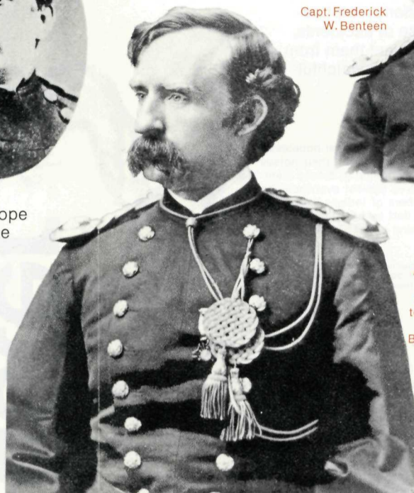
Capt. Frederick W. Benteen