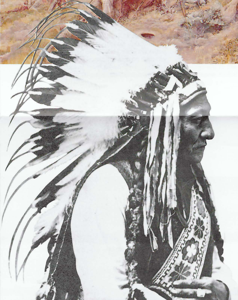
Sioux Chief Sitting Bull, an architect of Custer's defeat

This painting may not be reproduced without the permission of the artist.