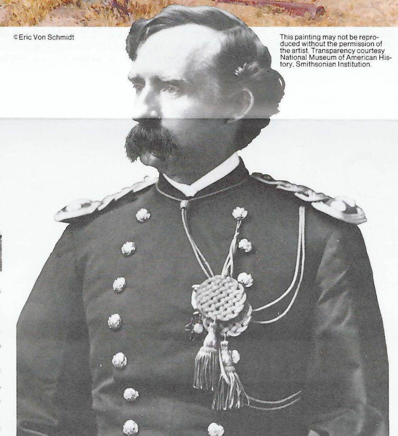
Lt. Col. George Armstrong Custer, 7th Cavalry Commander

of the Fort Laramie treaty. The army tried to keep them out, but to no avail. Efforts to buy the Black Hills from the Indians, and thus avoid another confrontation, also proved unsuccessful. In growing defiance, the Sioux and Cheyenne left the reservation and resumed raids on settlements and travelers along the fringes of Indian domain. In December 1875, the Commissioner of Indian Affairs ordered the tribes to return before January 31, 1876, or be treated as hostiles "by the military force." When the Indians did not comply, the army was called in to enforce the order.