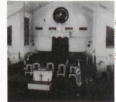
the Atlanta Daily World reported that immediately after Williams' proud announcement in 1929 that Ebenezer Baptist was nearly out of debt, "the church dedicated itself to

Like churches everywhere it offered spiritual guidance and comfort in time of need. But Ebenezer's role in the community was not solely religious. An article in