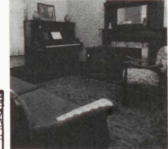
house College studying toward his divinity degree. Their three children, including their second child, Martin Jr., were born in the home.

The Kings and Alberta's mother remained here after Williams died in 1931. Ten years later, after the death of his grandmother, 12-year-old M.L. and his family moved a few blocks away to a new home.