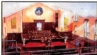
Artist's Rendering of the Heritage Sanctuary in the 1960's. (NPS Collection)

Superintendent, Martin Luther King Jr. NHS 450 Auburn Avenue NE Atlanta, GA 30312 (404) 331-5190 www.nps.gov/malu