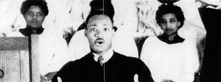
Dr. Martin Luther King Jr. preaching at Ebenezer Baptist Church, ca. 1963