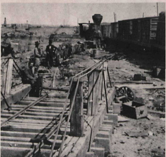
Manassas Junction, attacked by Jackson's men in August 1862.