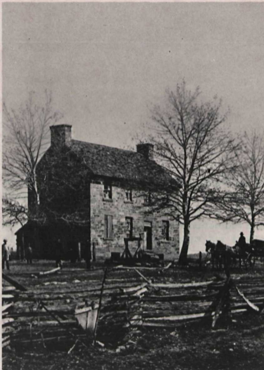
Stone House was a field hospital during both battles.