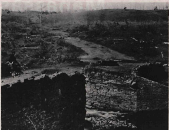
Stone Bridge. First Manassas began here in July 1861.