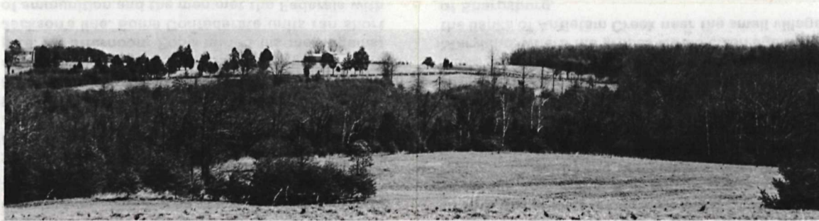
Henry Hill, looking east from Chinn Ridge, saw heavy fighting in both First and Second Manassas.

5. Chinn Ridge. In the late afternoon, Gen. Oliver O. Howard's Union brigade was attacked by Gen. Jubal Early's Confederates in this area. Howard's retreat led to the rout of the Union army.