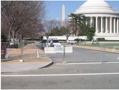
The Jefferson Memorial with the Washington Monument in the background

Conversely, the events of September 11, 2001, should have demonstrated to NPS the need to prioritize security measures at certain high-profile parks, but the organization has been slow in shifting its funding philosophy to effectively meet these needs. Simply stated, while the NPS recognizes the importance of awarding special parks with high-profile status, they have failed to apply a similar status when it comes to prioritizing funding. Though icon parks received base increases in recognition of their distinctive security needs, some of the money received by these parks has been redistributed to non-icon parks.