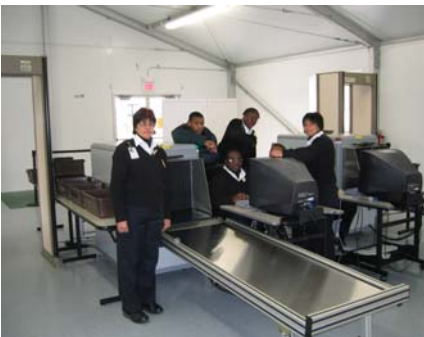
A typical screening site

Security cameras at some icon parks were located at such a lengthy distance from the monuments, for reasons having primarily to do with aesthetics and/or historic integrity, that veils of trees, along with various other impediments, actually obscured critical areas of vulnerability. While we recognize the significance of maintaining the historic nature of these parks, there has to be some room for accommodating adequate security measures, such as the aforementioned cameras. Moreover, we discovered many of these cameras remain unmonitored throughout the day and go dormant at night, relying then on motion-detection devices.