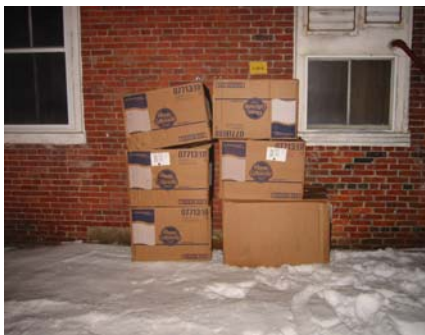
Simulated explosives placed next to a critical structure went undetected for several hours during high alert.

A standard protection plan needs to be developed for icon parks. Currently, each park has separate operational policies and staffing methodologies that not only fail to coincide but, in some instances, actually negate each other. For instance, visitor screening is not done at every park, the ratio of law enforcement officers on duty per area or per visitor varies, and the use of closed-circuit television cameras is different at each location. Some security personnel often appear confused about the specifics of their mission, which results in complacency and a sense of frustration and disinterest among law enforcement personnel. Also, some NPS officials exhibit an air of insolence while others feel unappreciated in the face of what they view as an overwhelming task not fully under their control.