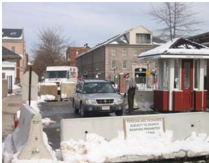
Security checkpoint at Boston Navy Yard

In short, the parks have not felt the pressure to perform, nor have they been held accountable for their noncompliance. The NPS and the Department must address these serious deficiencies within the security and law enforcement programs in order to adequately protect our national icons. Greater effort and guidance are needed in order to properly meet current security demands. Coordination and communication—two key characteristics of any well-functioning organization—are lacking. Specifically, we uncovered an over-reliance on small numbers of protection rangers and Park Police officers. Reliance on overworked and understaffed protection rangers and Park Police officers to provide satisfactory protection at icon parks is unwise. The park security workforce requires augmentation, and both current and incoming rangers and officers should receive more intense training in order to strengthen their skills and to enhance their ability to execute protection duties. Furthermore, technological solutions should be pursued, as well as the use of contract security personnel, where appropriate.