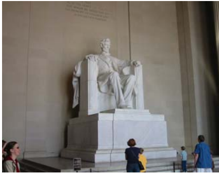
The Lincoln Memorial

left a national monument and its contract screeners without an immediate law enforcement presence. When this situation was brought to the attention of a Park Police supervisor, the supervisor's reply was, "Nothing I can do about that. The guy has to eat."