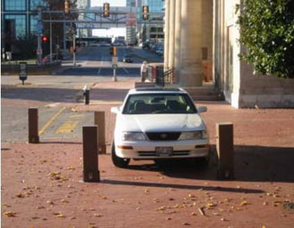
Improperly-distanced vehicle barriers

During our review, we observed security measures that appeared to have been haphazardly determined and hastily implemented. At one park, for example, we learned that security countermeasures were installed at a certain distance based on aesthetics rather than a scientific blast analysis or recognized security standards. At two other parks, we discovered an entrance gate unmanned, unprotected, and unmonitored just a short distance from what the park management advised was one of their top three vulnerable areas. Other security deficiencies included improperly-distanced vehicle barriers, inoperable security equipment, cameras without nighttime capabilities, ineffective alarm systems, exposed security wiring, and negligent security personnel.