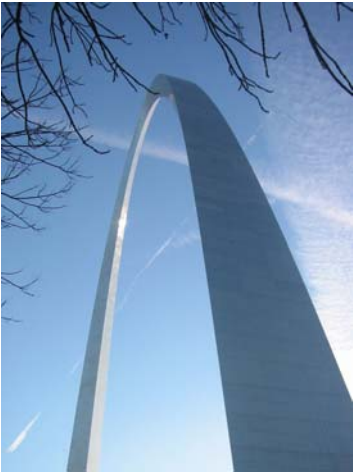
The St. Louis Gateway Arch