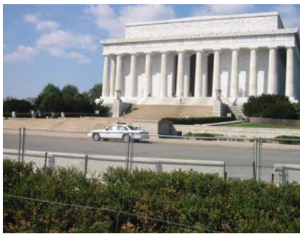
Security measures at the Lincoln Memorial

The NPS also lacks a comprehensive protection plan for its icon parks. As a result of operating without a service-wide plan, the NPS's efforts remain dependent upon each individual superintendent's willingness to adhere to and interpret the security program. This is a poor implementation of security measures, since the program itself lacks standards for NPS visitor screening, surveillance cameras, contract security guards, and vulnerability assessments. Until just recently, little evidence existed that icon park managers even communicated outside their respective boundaries in order to seek advice or to identify best practices. Recently, we were pleased to discover that the Northeast Region instituted regular icon park conference calls. This practice should be replicated in other Regions.