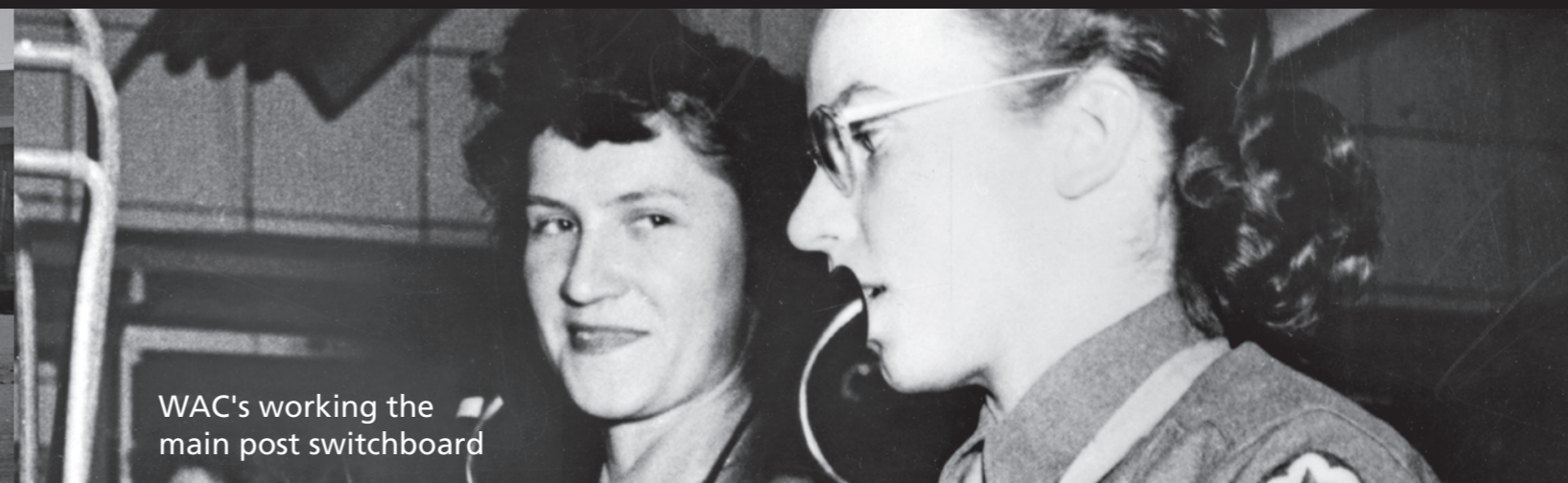
WAC's working the main post switchboard

In 1943, the United States government's Manhattan Project built a secret laboratory at Los Alamos, New Mexico, for a single military purpose—to develop the world's first atomic weapons. The success of this unprecedented, top-secret government program forever changed the world.