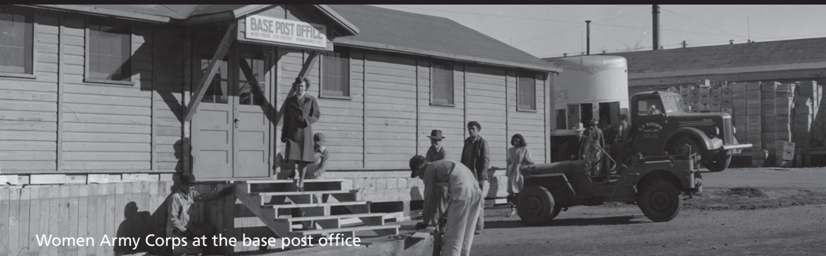
Women Army Corps at the base post office