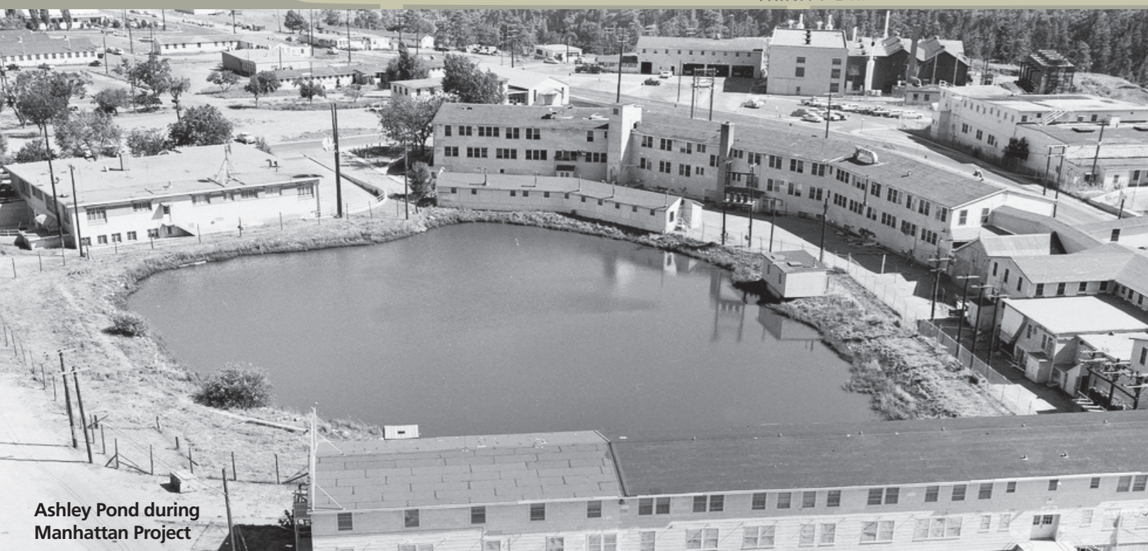
Ashley Pond during Manhattan Project

Over 60 interactive exhibits trace the history of the Manhattan Project, and describe Los Alamos National Laboratory's defense and technology research projects.