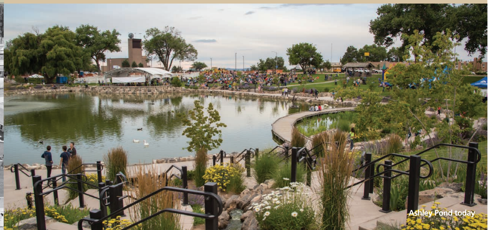
Ashley Pond today