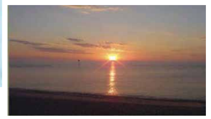
Figure 4: Channel Marker in Nantucket Sound; courtesy of NPS.

also as representatives of tribes across the nation. While you may see a channel marker, beyond that, really what you see is entirely natural. It is the belief-based association with the very natural maritime landscape that makes Nantucket significant for the tribes. People may ask, how is it a "landscape? It's really all water?" For the purposes of eligibility for the Register, districts that are significant landscapes often include bodies of water, large or small—some call them (informally) "riverscapes," "lakescapes," or "seascapes"—and a cultural landscape district can include anything that has to do with a broad natural expanse with natural features that may relate historically to a group or groups of people, including water.