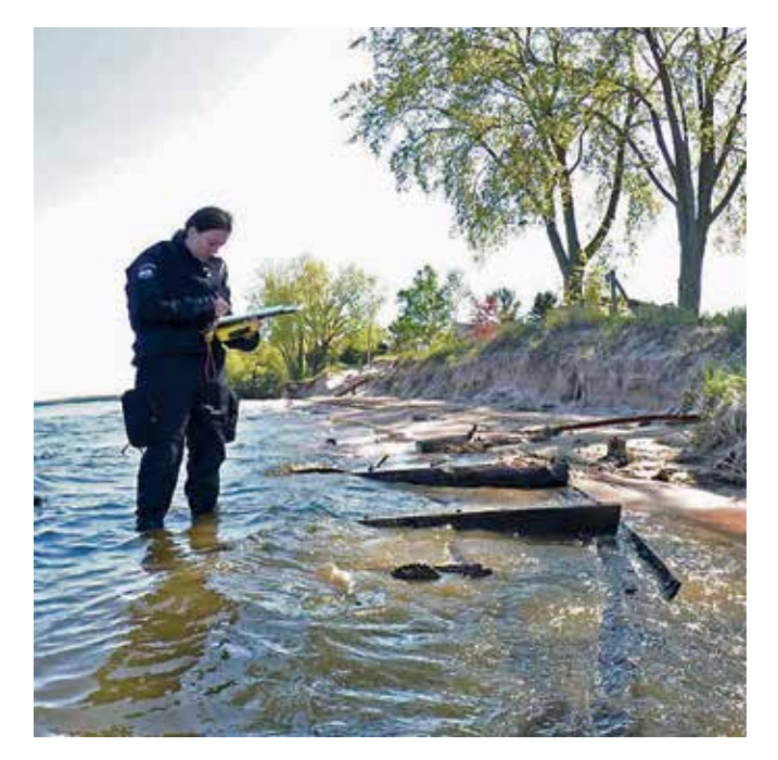
Jacksonport Wharf Archaeological District, Door County, Wisconsin. Today, during periods of calm water, the Reynolds Pier pilings can be seen protruding from the water's surface. In the image at the left, an archaeologist is recording observations.

We have also taken the initiative to revise all of our outreach in the Historical Society, to try to bind things together and to take individual isolated things that we are doing, pull them all together, and promote them jointly so during this next couple