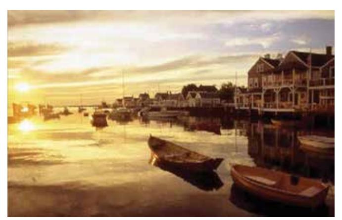
Figure 2: Sunset over Nantucket; courtesy of NPS.