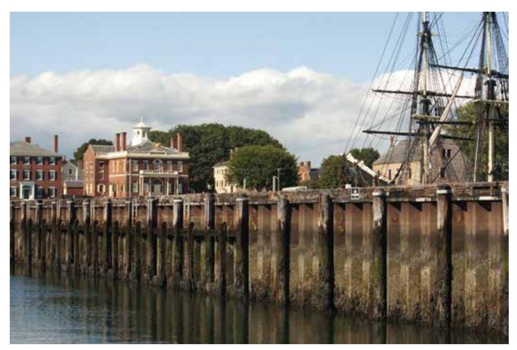
Salem Maritime National Historic Site, Salem, Massachusetts. Once more than 50 wharves extended into Salem Harbor. Three remain at the NPS historic site, which interprets colonial trade. Derby Wharf, built in 1806, is a half-mile long. The shorter Hatch's Wharf and Central Wharf were built in 1819 and 1791, respectively. The historic site includes some nine acres of land along the waterfront of Salem Harbor, including historic buildings, a replica of a tall ship, and the light station, built in 1871.