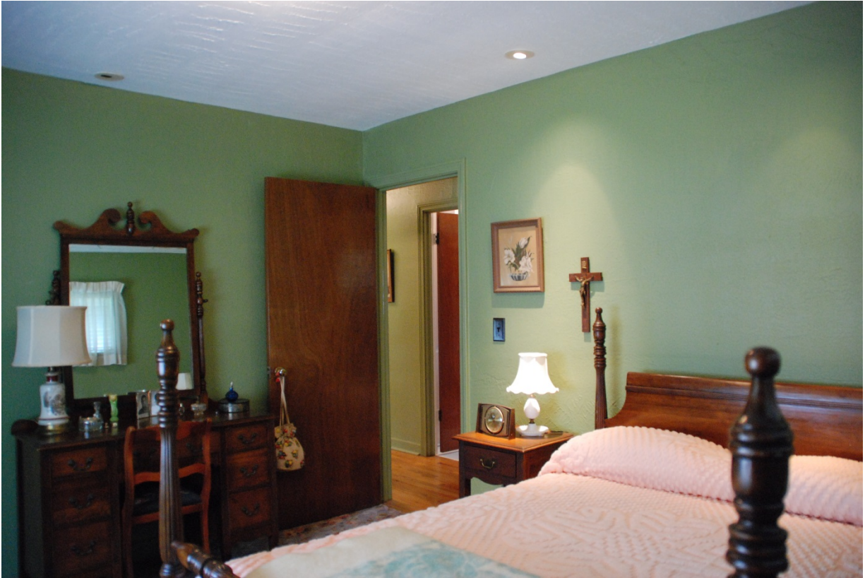
Master bedroom (SE room), view to NW, April 30, 2015 (above). Children's bedroom (S central room), view to SSW, April 30, 2015 (below).

National Register of Historic Places Registration Form