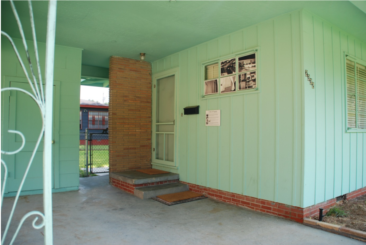
W elevation, main entrance under carport, view toward backyard, May 22, 2014 (above). Living room, from dining room, with main entrance to far right and front window in background, view to SSW, April 30, 2015 (below).

National Register of Historic Places Registration Form