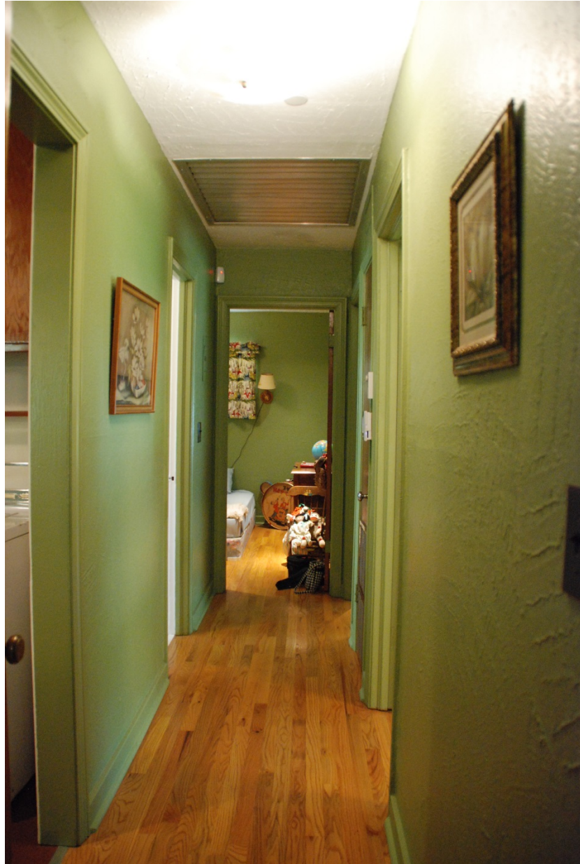
Hallway, view from living room toward bedrooms, with kitchen entrance to far left, view to E, April 30, 2015.

National Register of Historic Places Registration Form