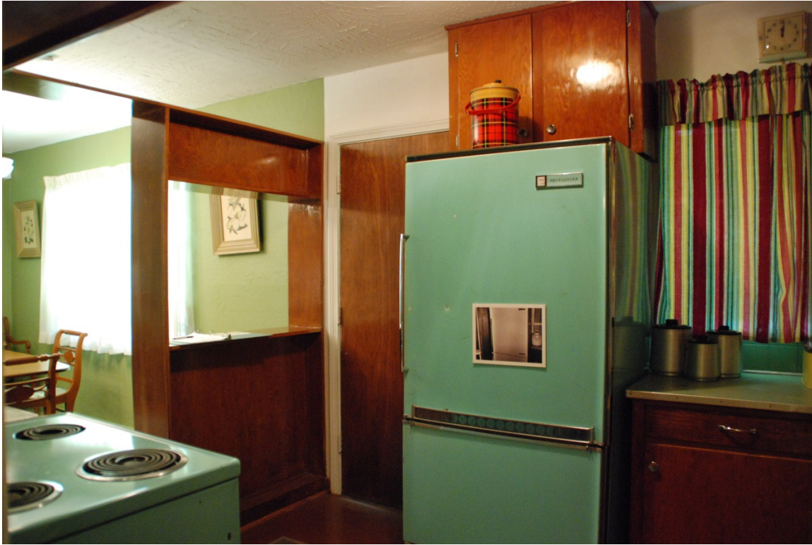
Kitchen, view from hall entrance toward rear exit and dining room, to NW, April 30, 2015 (above). Living room (right) and dining room (left), view from main entrance, hallway and bedrooms in background, view to E, April 30, 2015 (below).

National Register of Historic Places Registration Form