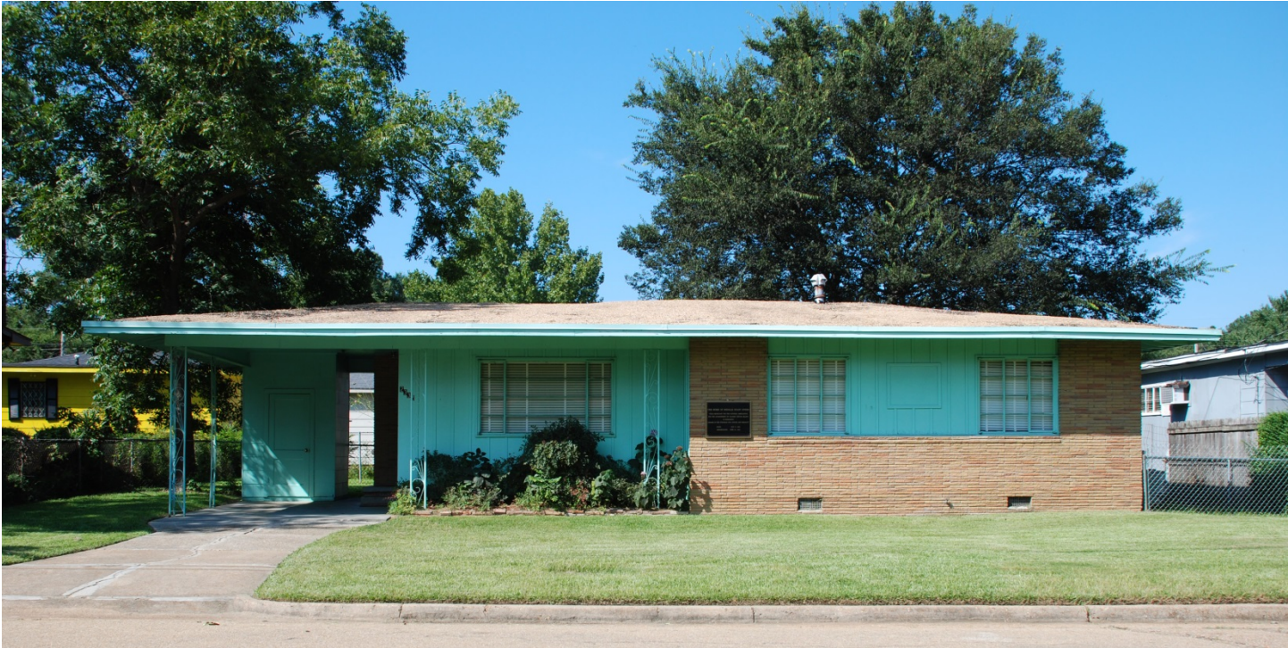
Front, south façade, view to north, September 7, 2008 (above). South façade and west elevation, view to NE, September 7, 2008 (below).

National Register of Historic Places Registration Form