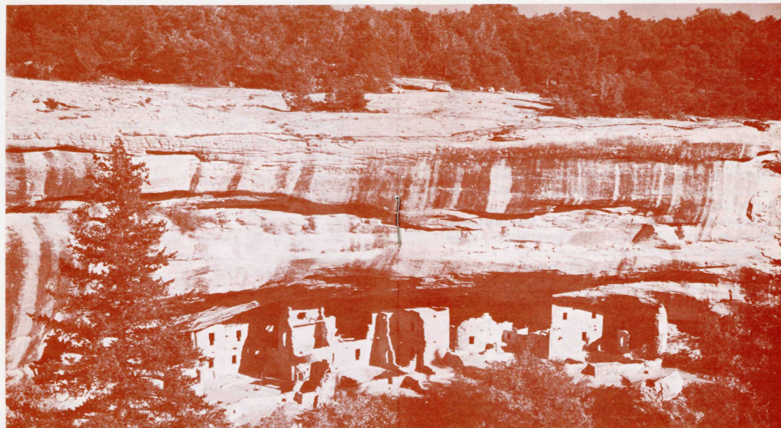
Spruce Tree House is the best preserved large cliff dwelling.

The move to the cliffs is a puzzling one, and archeologists are far from finding the answer as to whom or what these people may have feared. It is difficult to picture enemy groups being able to penetrate far into the Mesa Verde, yet the evidence would seem to point to the Pueblos being afraid of some threat and taking measures to combat