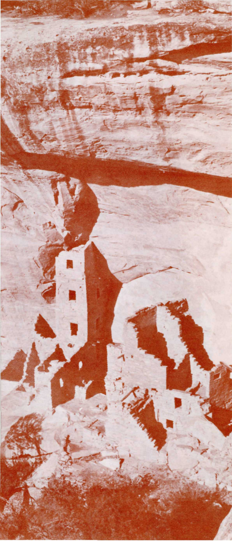
Square Tower House.

Large mesa-top ruins, such as Sun Temple, Cedar Tree Tower, Far View House, and Pipe Shrine House, may be photographed any time during the day.