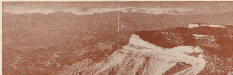
LA PLATA MOUNTAINS AND KNIFE EDGE FROM NORTH RIM OF MESA VERDE