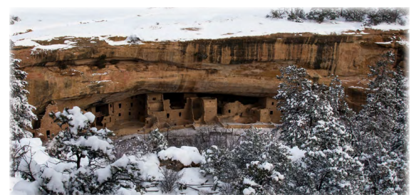
Spruce Tree House from overlook

*It is a 45- to 60-minute drive from the park entrance to Spruce Tree House and the museum.