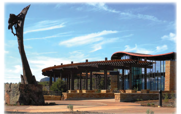
Welcome Plaza, Mesa Verde Visitor and Research Center

*When the entrance station is closed, please stop by the the Visitor and Research Center to pay your entrance fee and support your parks.