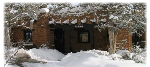
Chapin Mesa Archeological Museum

Chapin Mesa Archeological Museum and Store will help you gain insights into the lives of the Ancestral Pueblo people. The museum is located 20 miles (33 km) south of the park entrance. A 25-minute park video is shown every half hour. Open daily except Thanksgiving, Christmas, and New Year's Day.