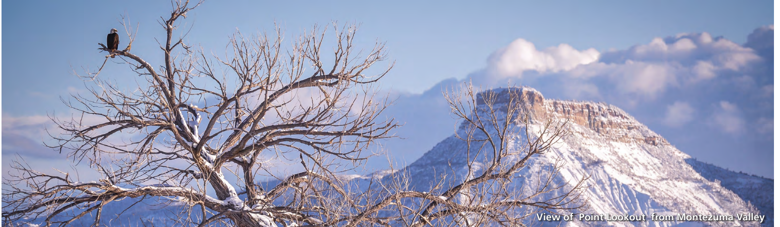
View of Point Lookout from Montezuma Valley