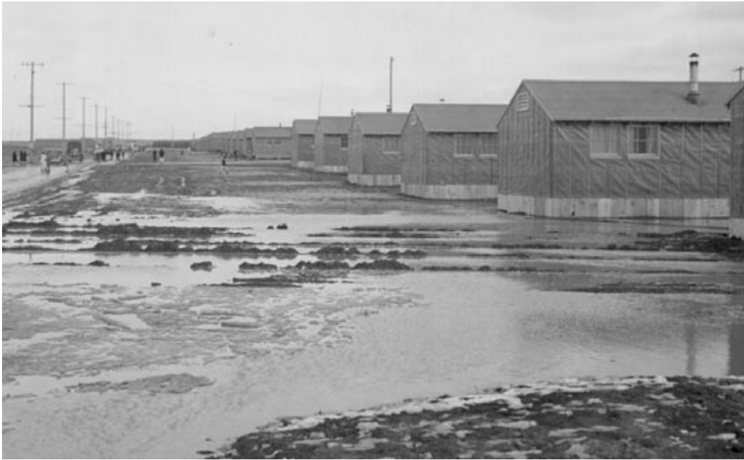
Early spring scene at the Minidoka Wartime Relocation Center.