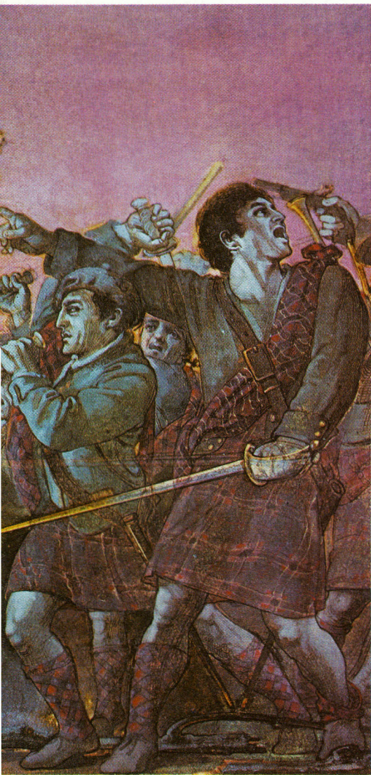
National Military Park, North Carolina