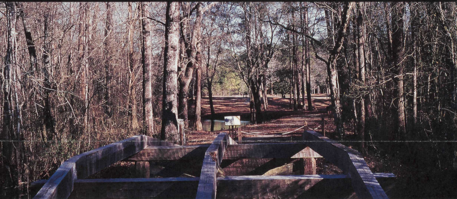
Patriots removed planks from the original bridge to keep loyalists from crossing. This is a reconstruction.