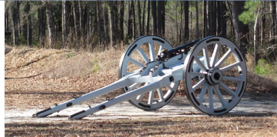
HIGHLANDERS—NPS / GIL COHEN; BRIDGE AND CANNON—NPS