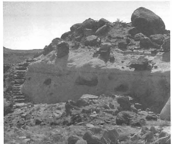
Volcanic ash deposits create colorful cliffs north of Hole-in-the-Wall Campground.

This trail showcases the Mojave's dramatic geology. One mile north of Hole-in-the-Wall Campground, a viewpoint offers scenic vistas in all directions, including nearby Table Top Mountain, an easily recognizable landmark for travelers heading west across the desert more than a century ago. A stone staircase skirts volcanic ash deposits known as tuff, while the Opalite Cliffs glisten like diamonds among the rocks. About 1 mile of the trail follows a dirt road, which is also the same route as the southern portion of the Mid Hills to Hole-in-the-Wall Trail (see below).