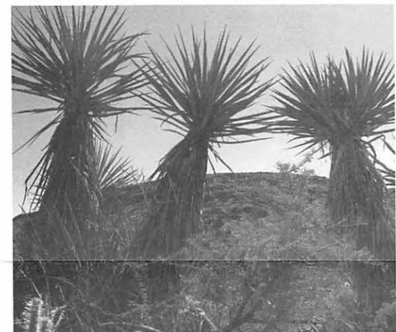
Tall Mojave yucca grow among a mix of cactus at the southern end of the Mid Hills to Hole-in-the-Wall Trail.

The route, a combination of hiking trails and sections of dirt roads, works especially well if you have two vehicles or are planning to camp overnight along the trail. From Mid Hills, the trail descends 1,200 feet to Hole-in-the-Wall through a maze of washes decorated with barrel and cholla cacti. The charred skeletons of juniper, pinyon, and yucca remain from the 2005 Hackberry Fire, though many small shrubs and wildflowers have returned to the area. Nearing Hole-in-the-Wall, the white deposits of the Opalite Cliffs sparkle in the sunlight. The world's tallest yucca, over 31 feet tall, grew near the southern section of the trail until it blew over in 2008, but there are many possible contenders for that title among the remaining yuccas.