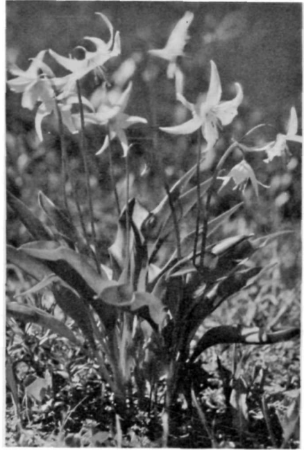
Avalanche lily.

Recent studies indicate that the ice of the Nisqually Glacier at midelevations is in continuous movement at a rate of about 25 feet per month. Such movement in all of the active glaciers thus slowly carries ice from the basins and canyons of upper elevations, where the deep winter snow pack forms the glacial ice, to lower elevations, where most melting occurs. The heaviest snowfall comes at elevations between approximately 5,000 and 10,000 feet as the summit is often above the storm clouds, both in summer and winter. The accumulated snowfall adds to the weight of the ice and is thus partly responsible for the movement of the glaciers out of their basins. In modern times the melting at the lower levels has exceeded the replenishment by downward movement. Each glacier thus is becoming shorter. The recession of the Nisqually and Emmons Glaciers has averaged about 75 feet per year for the past 20 years, while the Paradise Glacier is melting back at the rate of from 40 to 50 feet per year. Thus, each year new ground is exposed for the first time in history. The slow advance of vegetation to cover the newly exposed barren rock, the formation of waterfalls where streams today plunge abruptly into canyons that were once ice-filled, the formation of small lakes—these and many other processes of landscape develop-