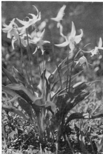
Avalanche lily.

Recent studies indicate that the ice of the Nisqually Glacier at midelevations is in continuous movement at a rate of about 25 feet per month. Such movement in all of the active glaciers thus slowly carries ice from the basins and canyons of upper elevations, where the deep winter snow pack forms the glacial ice, to lower elevations, where most melting occurs. The heaviest snowfall comes at elevations between approximately 5,000 and 10,000 feet as the summit is often above the storm clouds, both in summer and winter. The accumulated snowfall adds to the weight of the ice and is thus partly responsible for the movement of the glaciers out of their basins. In modern times the melting at the lower levels has exceeded the replenishment by downward movement. Each glacier thus is becoming shorter. Recent studies at slightly higher elevations show thickening of the ice on the Nisqually and the Emmons Glaciers, indicating growth in ice volume. Recession at the extreme terminus of the ice exposes new ground for the first time in history. The slow advance of vegetation to cover the newly exposed barren rock, the formation of waterfalls where streams today plunge abruptly into canyons that were once ice-filled, the formation of small lakes—these and many other processes