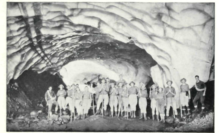
ICE CAVE, PARADISE GLACIER

Enjoy your National Park and experience the thrills of exploring nature's outstanding accomplishments.