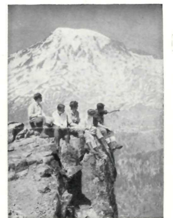
ON PINNACLE PEAK