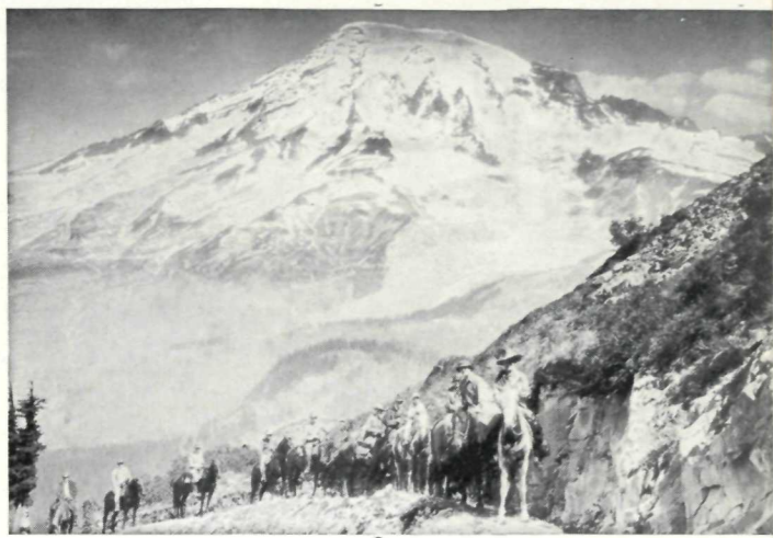
SADDLE HORSE PARTY ON TATOOSH TRAIL