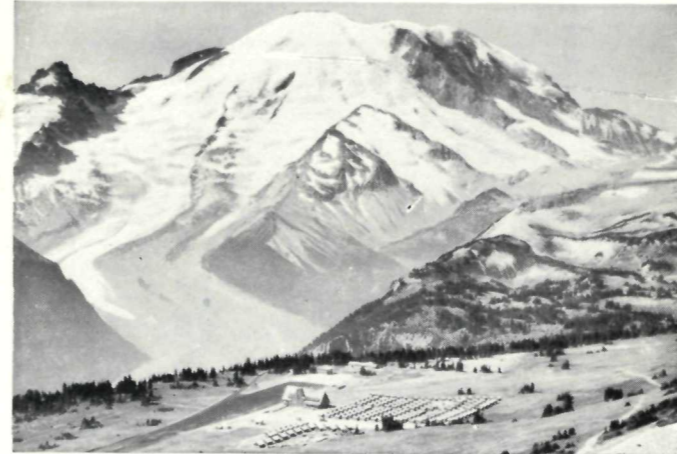
SUNRISE LODGE AND CABINS

SUNRISE, the newest recreational center in the Park, is reached over excellent highways just 89 miles from Tacoma, 96 miles from Seattle and 91 miles from Yakima. Not only is Sunrise noted for outstanding saddle horse trails but the Emmons Glacier, largest in Continental United States, may be seen here.