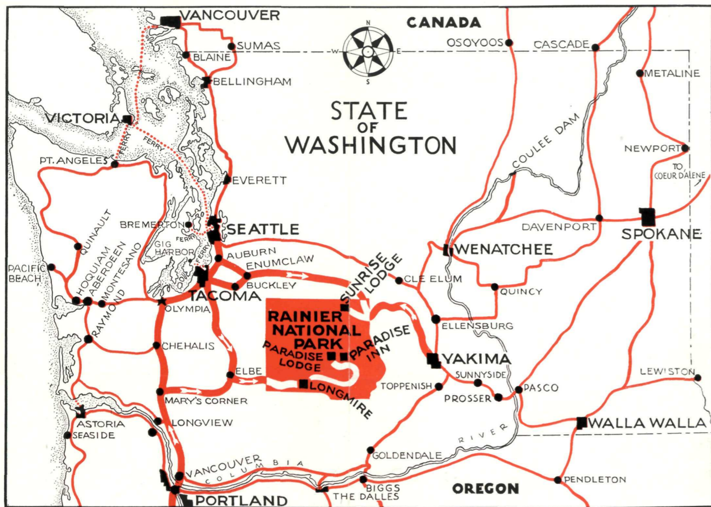
TABLE OF DISTANCES

RAINIER NATIONAL PARK is conveniently reached by all state highways through the gateway cities of Seattle, Tacoma and Yakima. A table of distances from the leading cities in the State to the north and south side areas in Rainier National Park is given below.