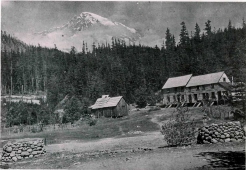
LONGMIRE HOTEL, ca. 1910