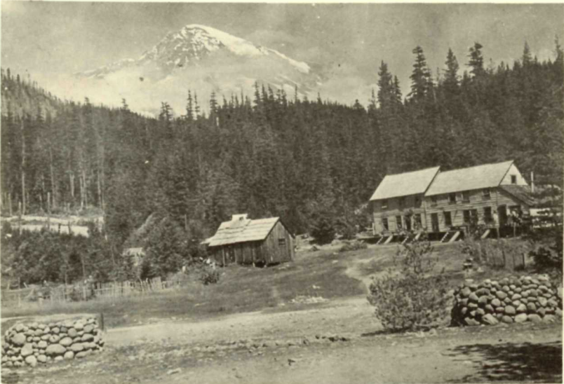
LONGMIRE HOTEL, ca. 1910